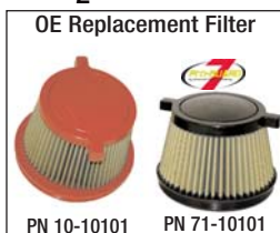
PN 10-10101 PN 71-10101

Restore Kits 90-50001 Blue Aerosol 90-50501 Blue Squeeze 90-50000 Gold Aerosol 90-50500 Gold Squeeze