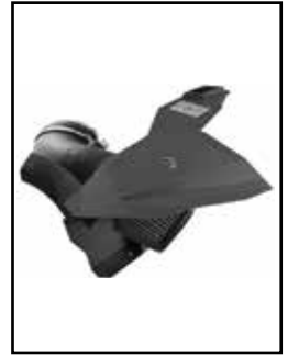
Stage 2 Intake System