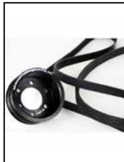
Power Pulley (2007-2008.5)