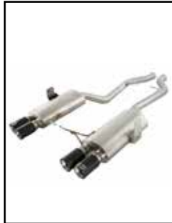
Cat Back Exhaust (E90)