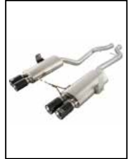
Cat Back Exhaust (E92/93)