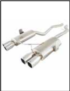
Cat Back Exhaust (E90)