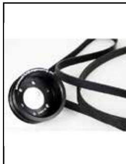
Power Pulley (2009-2013)