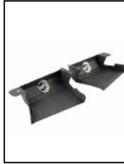
Dynamic Air Scoops