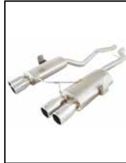
Cat Back Exhaust (E92/93)