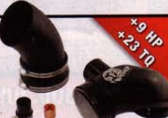
COLD AIR INTAKE Starting at $425