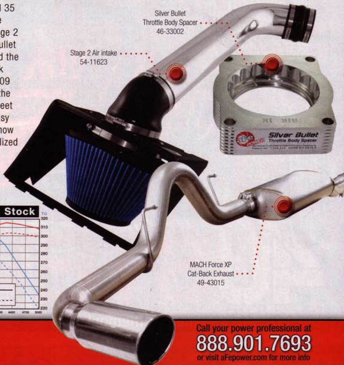
MACH Force XP Cat-Back Exhaust ••••• 49-43015