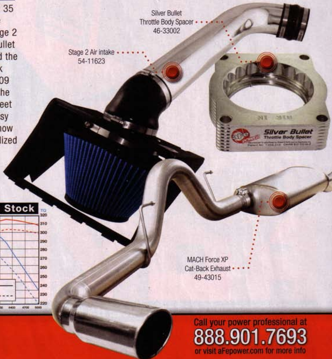
MACH Force XP Cat-Back Exhaust 49-43015