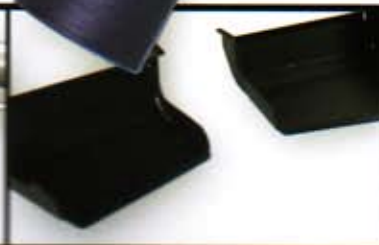
D.A.S. AIR SCOOPS