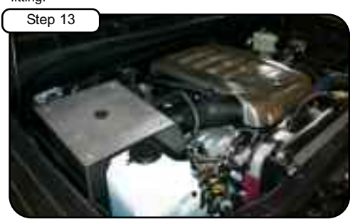
Your installation is now complete. Check all clamps and hoses periodically. Thank you for choosing aFe!