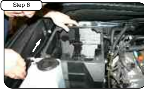
Install trim seal provided to auxilary on side. Install filter adaptor to new housing with button head screws provided and secure. Install new housing using screws and grommets from step 5.