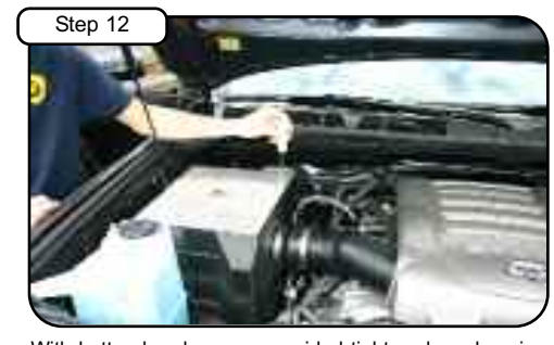
With button head screws provided tighten down housing cover with 5/32" allen key. Re-Install engine cover.