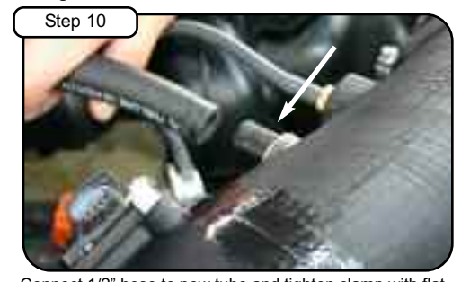
Connect 1/2" hose to new tube and tighten clamp with flathead screwdriver. Re-connect MAF sensor harness and fuel regulator.