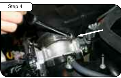
With 5/16" nut driver loosen both clamps on OE intake tube. Remove crankcase and vacuum line away from tube. Disconnect MAF sensor harness & remove.