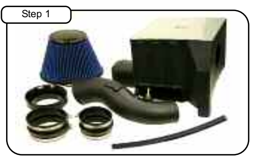
Complete kit with parts.