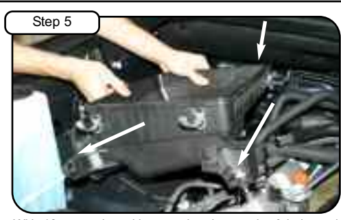
With 12mm socket with extension, loosen the 3 bolts and remove the OE air box out of vehicle. Note: Save 3 bolts and grommets for later install.