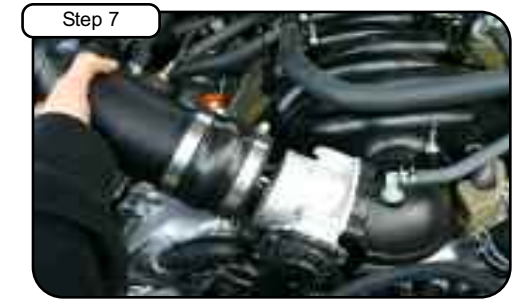
With couplers and clamps provided, place onto new intake tube and install. Make sure 4-1/4" coupler is on filter side and 3-1/2" coupler is on throttle body side .