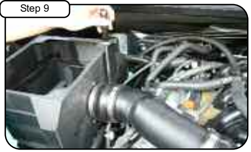
Tighten clamps with 5/16" nut driver. Take out OE crankcase line and replace with 1/2" hose and clamp provided.