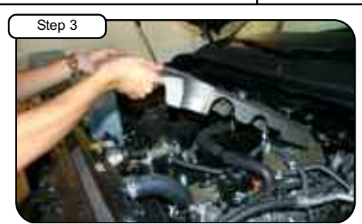
Lift up and remove engine cover.