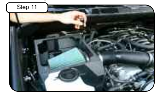
Place air filter into housing and tighten using 5/16" nut driver.