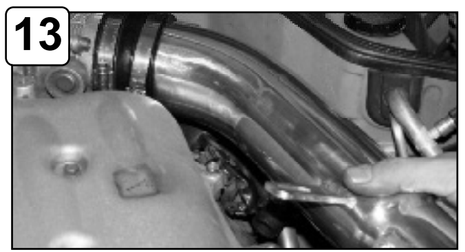
Insert tube into couplings. Locate hole on tab to mounting location on engine plenum.

For replacement part(s) or "Restore Kit" please log on to takedausa.com P.O. Box 1719 Corona CA, 92878