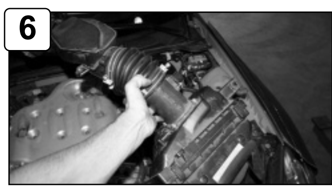
Carefully remove stock air box assembly out of vehicle. (ram scoop optional.)