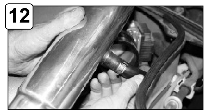
Attach crank case line to intake tube.