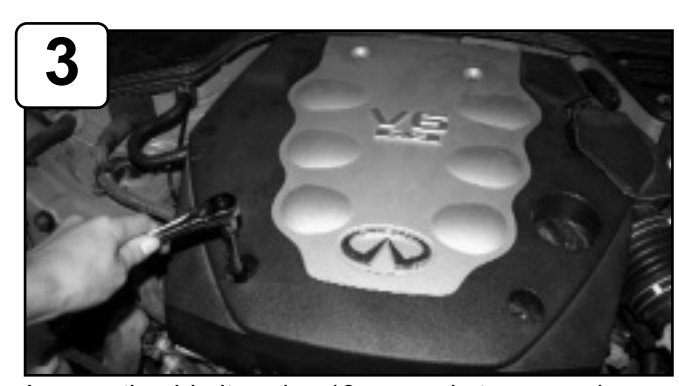
Loosen the 4 bolts using 10mm socket or wrench holding in engine cover and remove.