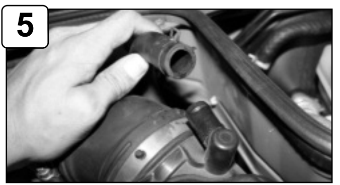
Remove crank case line from stock intake tube. Disconnect MAF sensor harness.