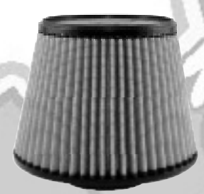
Replacement Filter P/N: TF-9006D