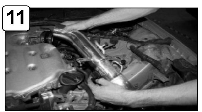
Align intake to coupler on throttle body and bracket location.