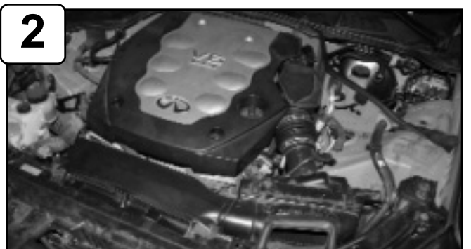
Complete Stock intake. Please disconnect battery terminals before installation.