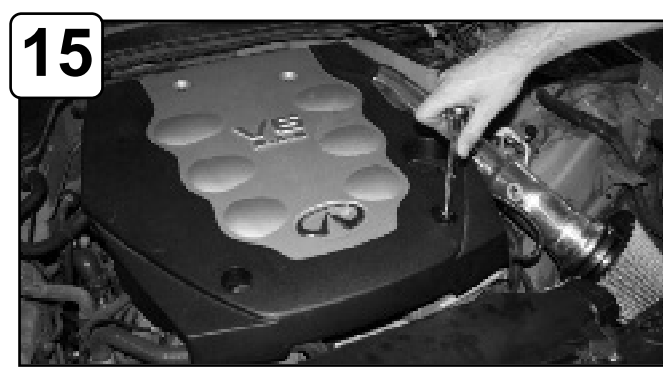
Re-install engine cover and tighten using 10mm socket or wrench.