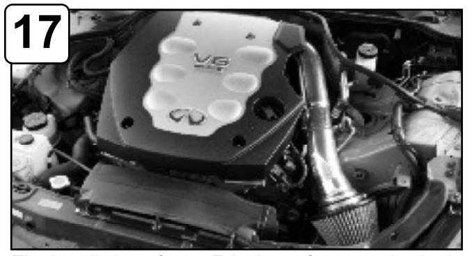
The installation of your Takeda performance intake is now complete. Please check all components and retighten if necessary. Thank you for choosing Takeda!

Place the included CARB EO sticker on or near the intake system on a smooth, clean surface. E.O. identification label is required in passing the smog check inspection.