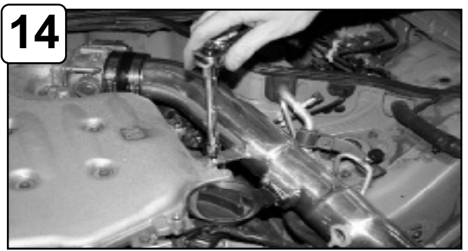
Secure tube and tighten using M6 screw and washer provided. Tighten using 10mm socket or wrench.