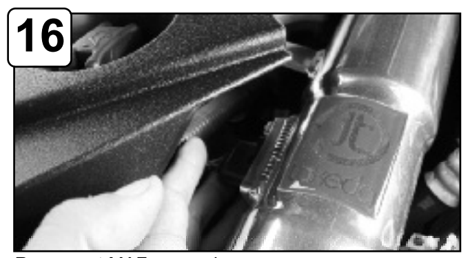
Reconnect MAF sensor harness.