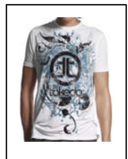
P/N: TP-7004T M P/N: TP-7005T L P/N: TP-7006T XL P/N: TP-7007T 2XL