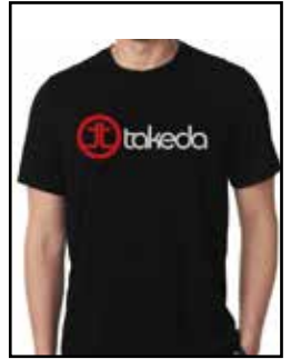
Takeda Mens T-Shirt

P/N: 40-30332 (M) 40-30333 (L) 40-30334 (XL)