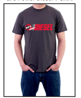
aFe Power Diesel T-Shirt

P/N: 40-30222-G (L) P/N: 40-30223-G (XL) P/N: 40-30223-G (2XL) P/N: 40-30223-G (3XL)