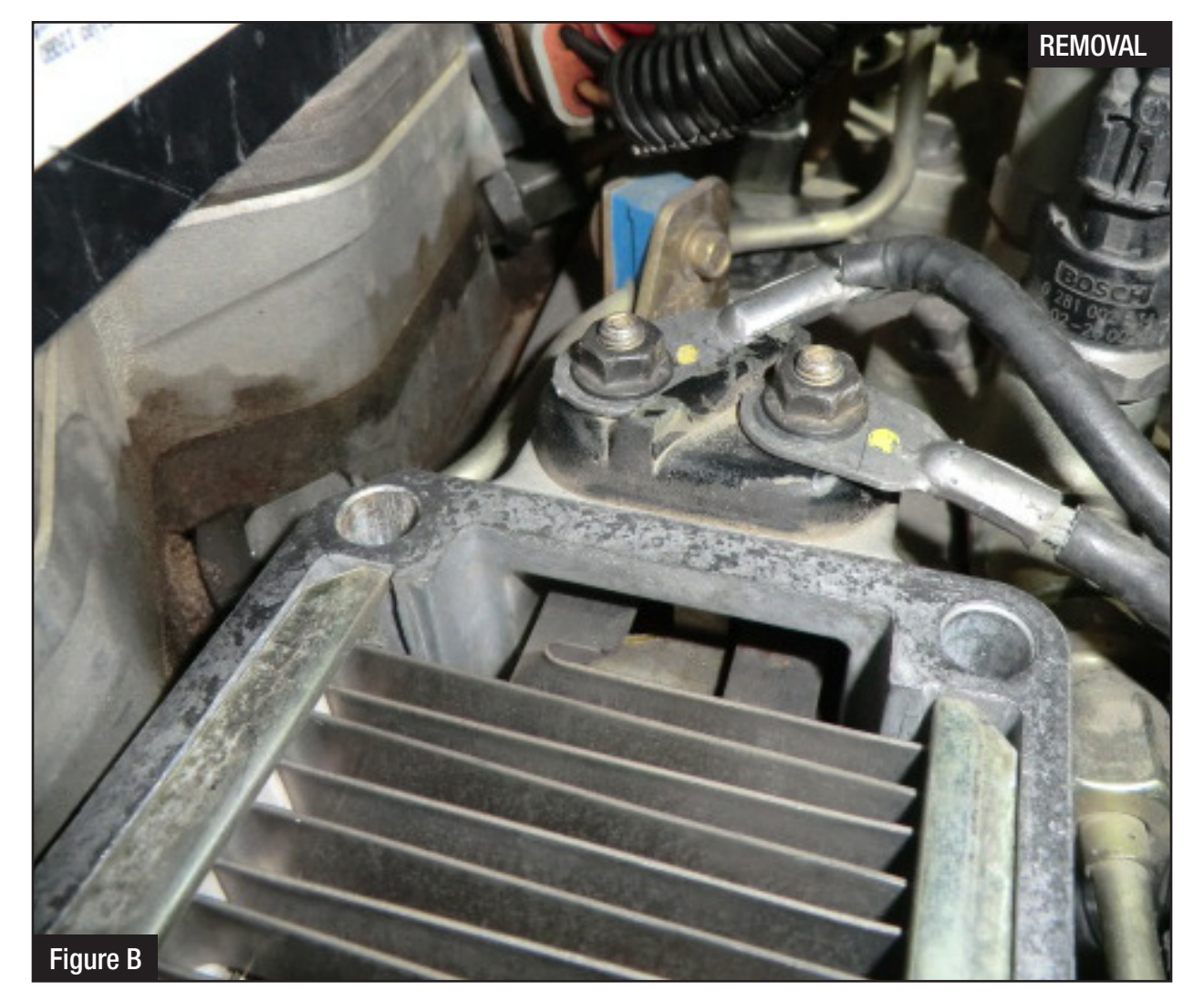
Refer to Figure B for steps 5-6

Step 5: Remove the (2) 10mm nuts from the intake heater.