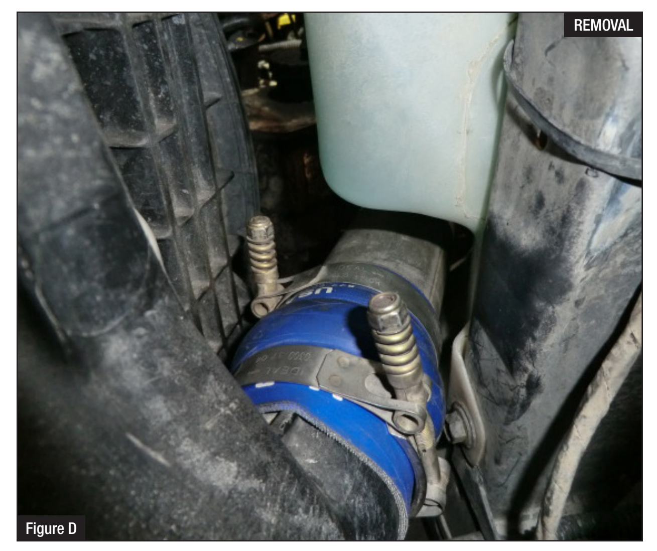
Refer to Figure D for step 9-10 (For Kit P/N: 46-11012 or 46-11013)

Step 9: Remove the clamps on the hump hose at the intercooler.