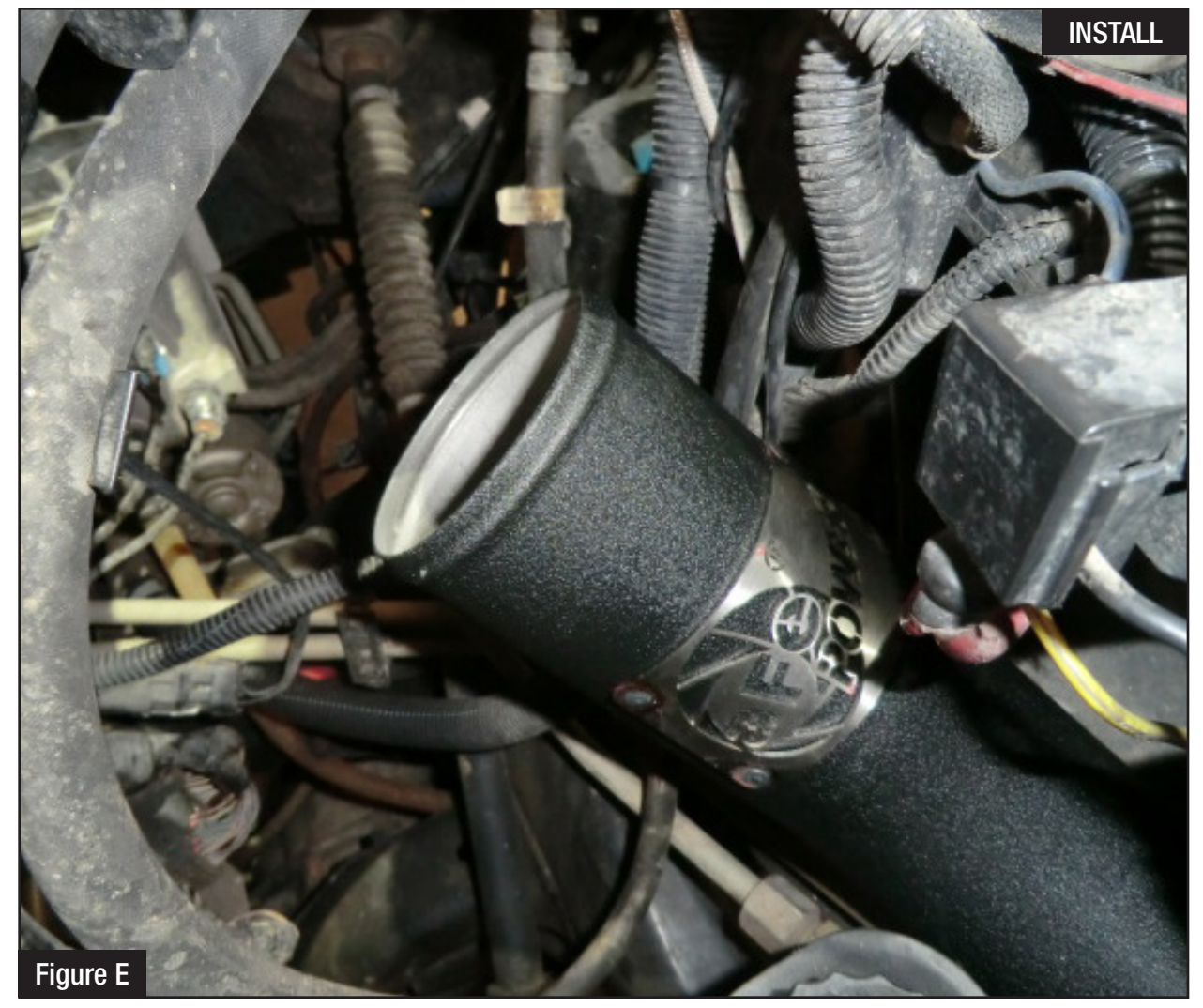
Refer to Figure E for step 11 (For Kit P/N: 46-11012 or 46-11013)

Step 11: Install the aFe boost tube in the vehicle. Insert in the hump hose at the intercooler and leave loose at this time.