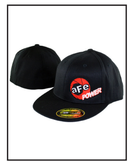
P/N: 40-10114 (S/M) P/N: 40-10115 (L/XL)