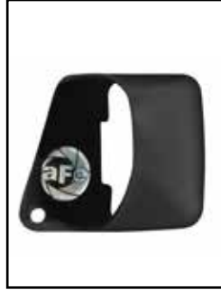
Dynamic Air Scoop

P/N: 54-12218 (Black) 54-12218-C (C/F) 54-12218-L (Blue) 54-12218-R (Red)