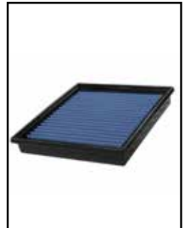
OE Replacement Filter

P/N: 54-12218 (Black) 54-12218-C (C/F) 54-12218-L (Blue) 54-12218-R (Red)