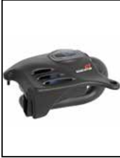
Cold Air Intake System