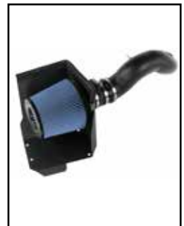
P/N: 51-11072 (PDS) 54-11072 (P5R)