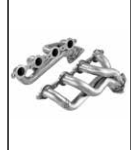
P/N: 48-44001 ('02-'13)

To purchase any of the items above, view airflow charts, dyno graphs, photos, and video; please go to aFepower.com.