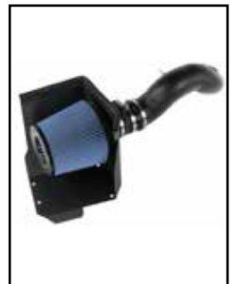
P/N: 51-11072 (PDS) 54-11072 (P5R)