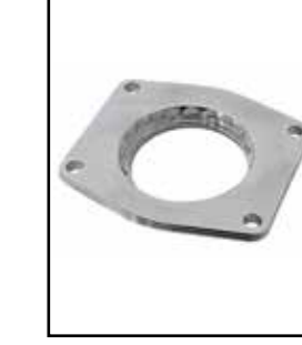
P/N: 46-34008 ('14-'17)