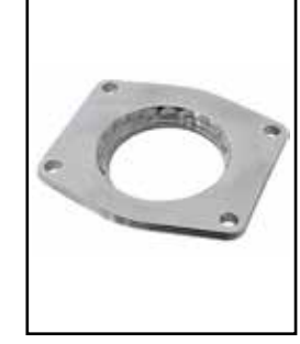
P/N: 46-34008 ('14-'17)