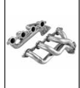
P/N: 48-44001 ('02-'13)

To purchase any of the items above, view airflow charts, dyno graphs, photos, and video; please go to aFepower.com.