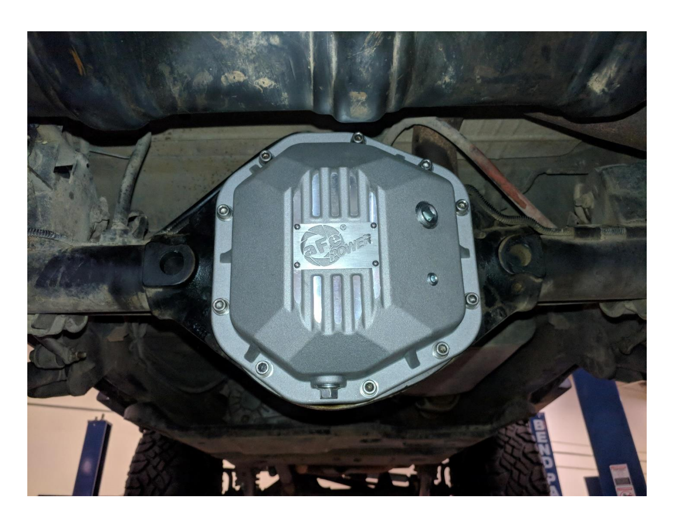
21. Apply Teflon pipe sealant to the threads of the supplied 1/2" NPT plug and install into the fill port on the front of the cover.