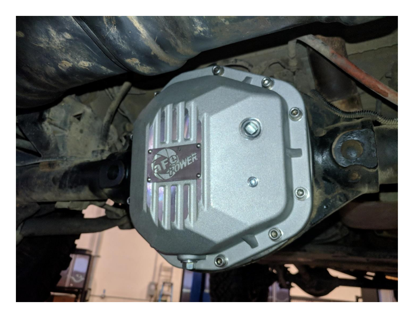
22. Your installation is complete.