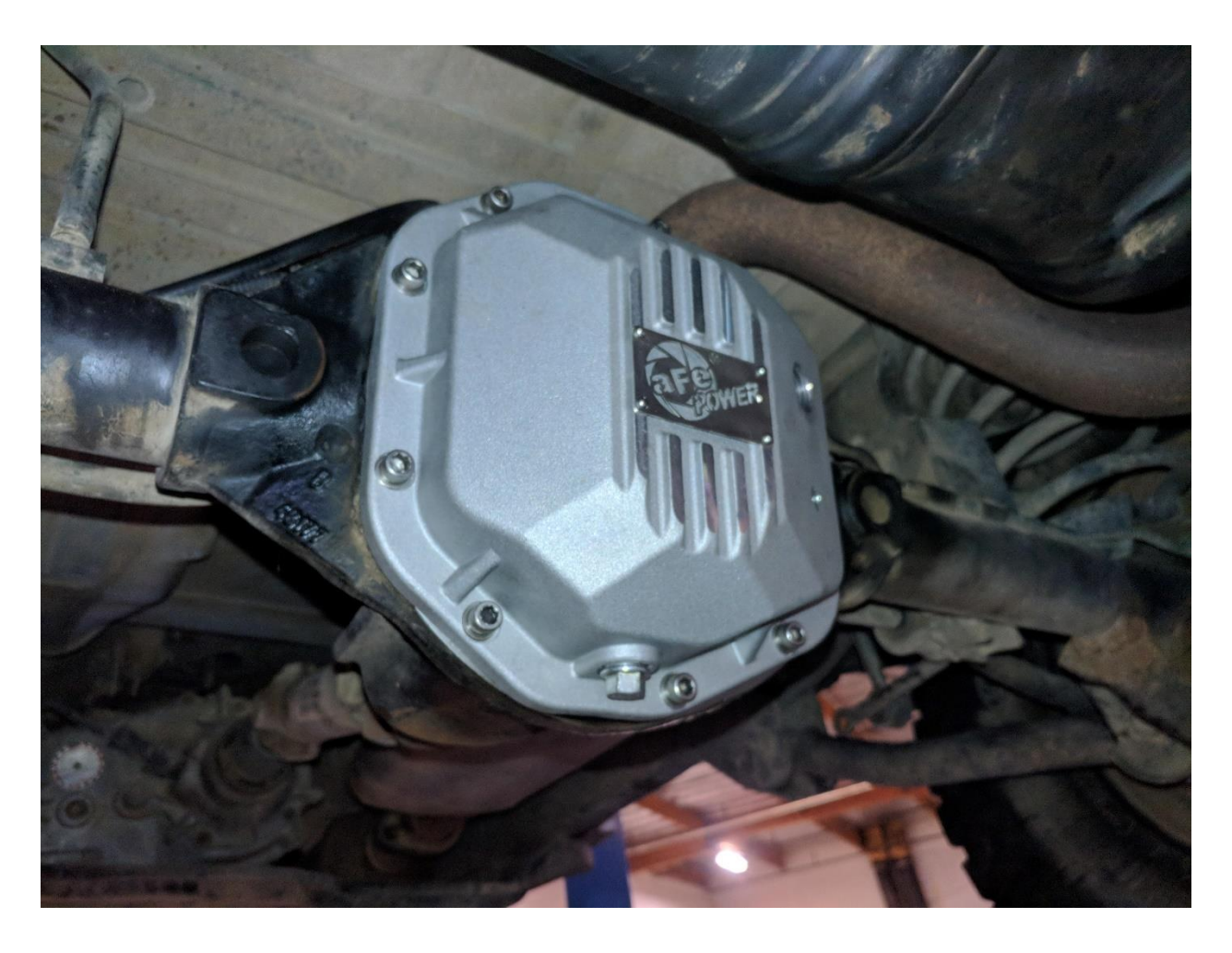
18. Install the supplied M12 x 1.25 drain plug and crush washer into the bottom of the cover.