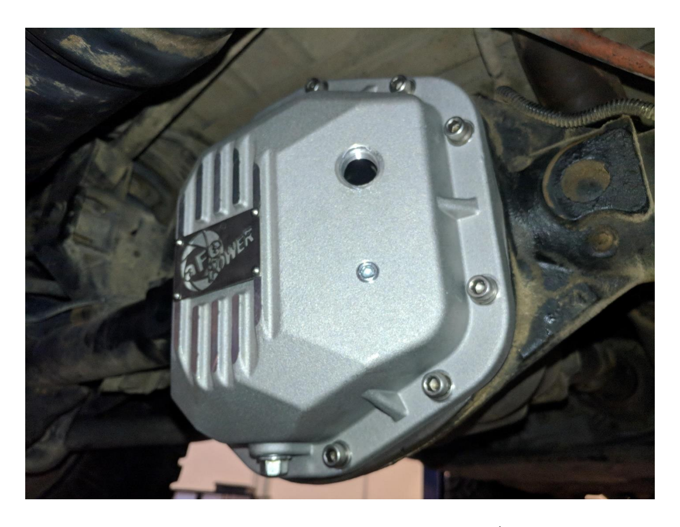
20. Apply Teflon pipe sealant to the threads of the supplied 1/8" NPT plug and install into the front of the cover.