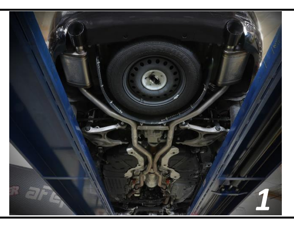
Page 1 of 3

Install band clamps to proper torque specifications of 40-45 ft-lb.