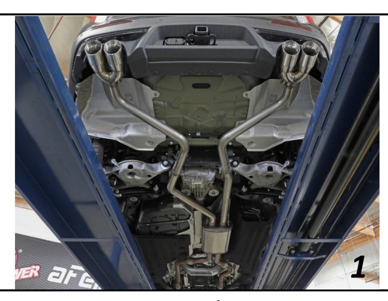
Page 1 of 2

Install band clamps to proper torque specifications of 40-45 ft-lb.