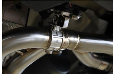
Page 2 of 2