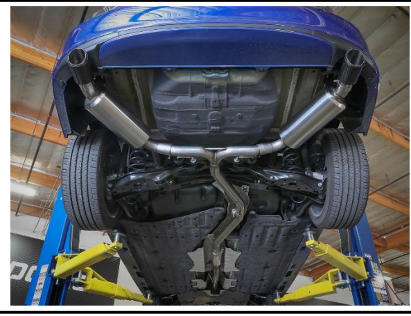
Page 1 of 2

Install V-band clamps with anti-seize lubricant and hand tighten only to torque specifications of 10-15 ft-lb.