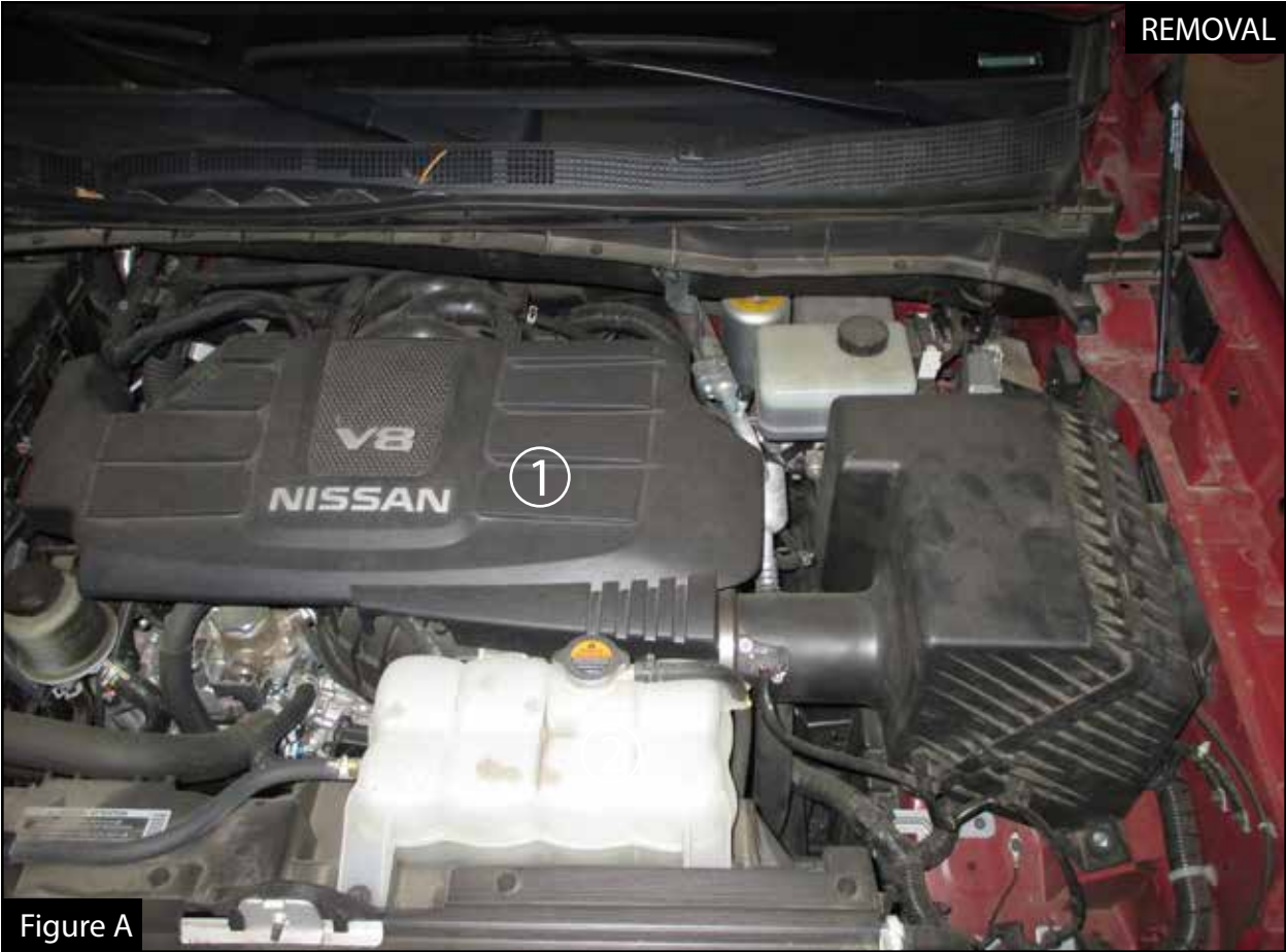
<u>Refer to Figure A for Step 1</u> Step 1: Remove the cover by pulling up and toward the front bumper cover(1).