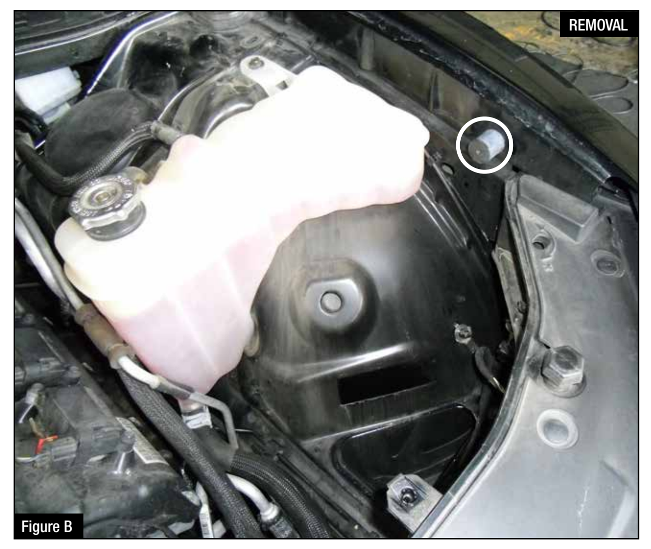
Refer to Figure B for Steps 6-7

Step 6: Remove 10mm bolt from fender side, it will not be reused.