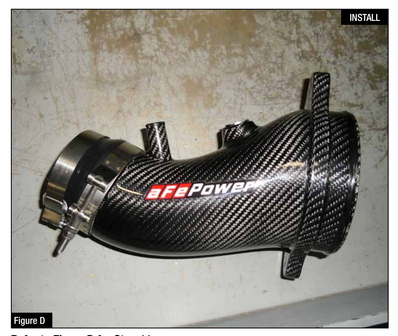
Refer to Figure D for Step 11