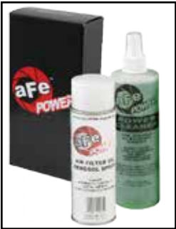
Blue Aerosol Restore Kit