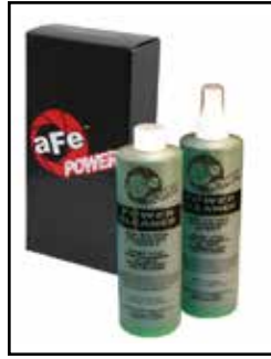
Pro DRY S Restore Kit