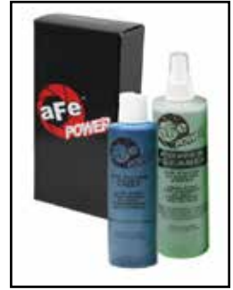
Blue Squeeze Restore Kit