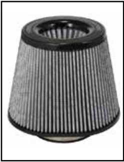
Pro DRY S Air Filter