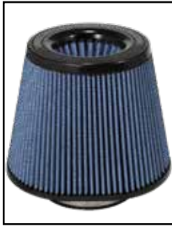
Pro 5R Air Filter