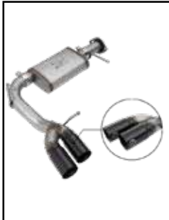
Rebel Exhaust System

P/N: 49-44058-B (Blk Tips) 49-44058-P (Pol Tips)