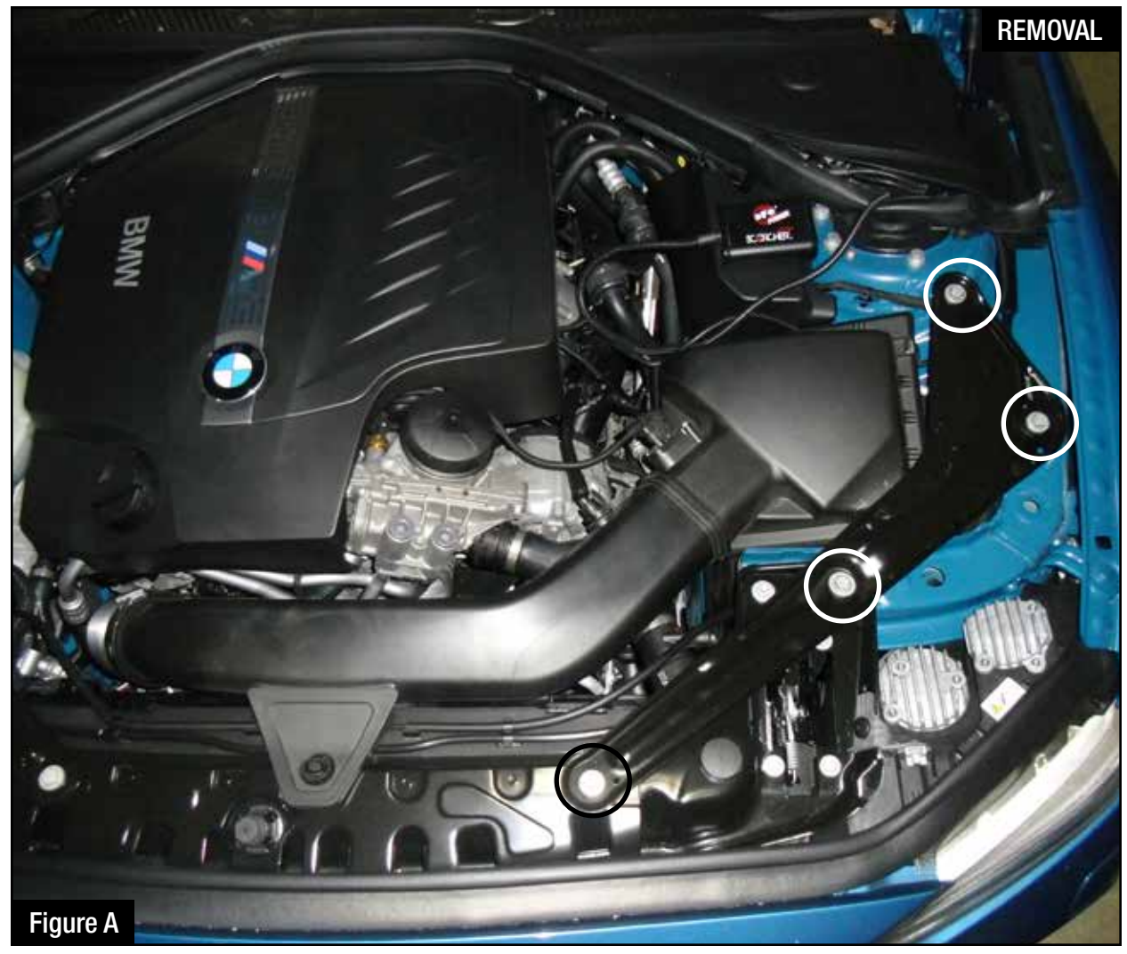
Refer to Figure A for Step 1

Step 1: If your vehicle is equipped with a brace, take it off by removing the four 13mm bolts.