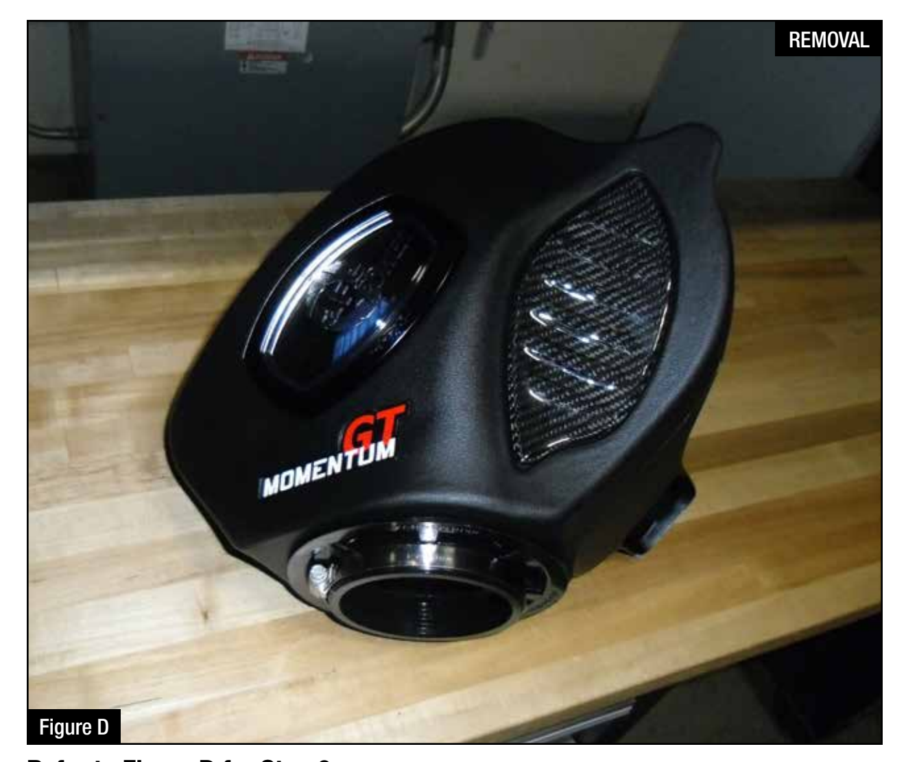
Refer to Figure D for Step 9

Step 9: Pick the dry or oiled filter and push it into the housing until it snaps into place.