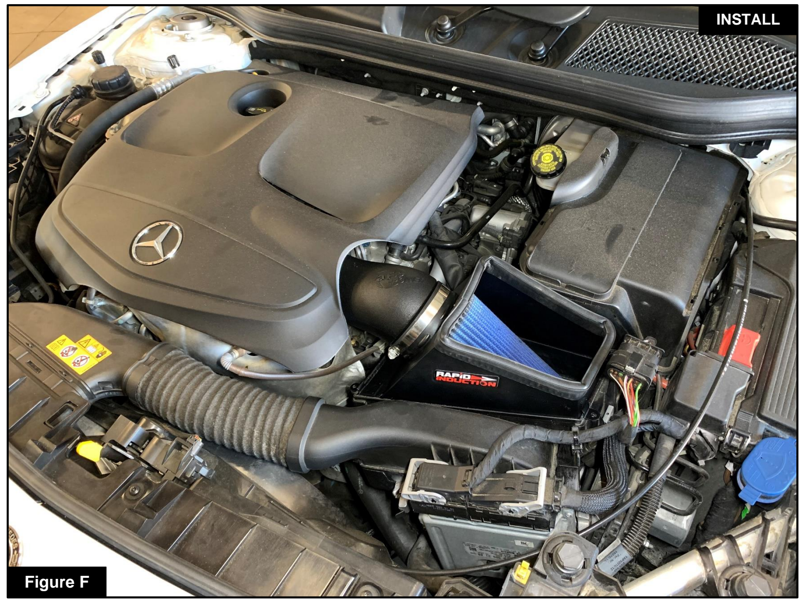
Refer to Figure F for Step 9

Step 9: Reinstall the engine cover. Your installation is complete. Thank You for choosing aFe POWER!