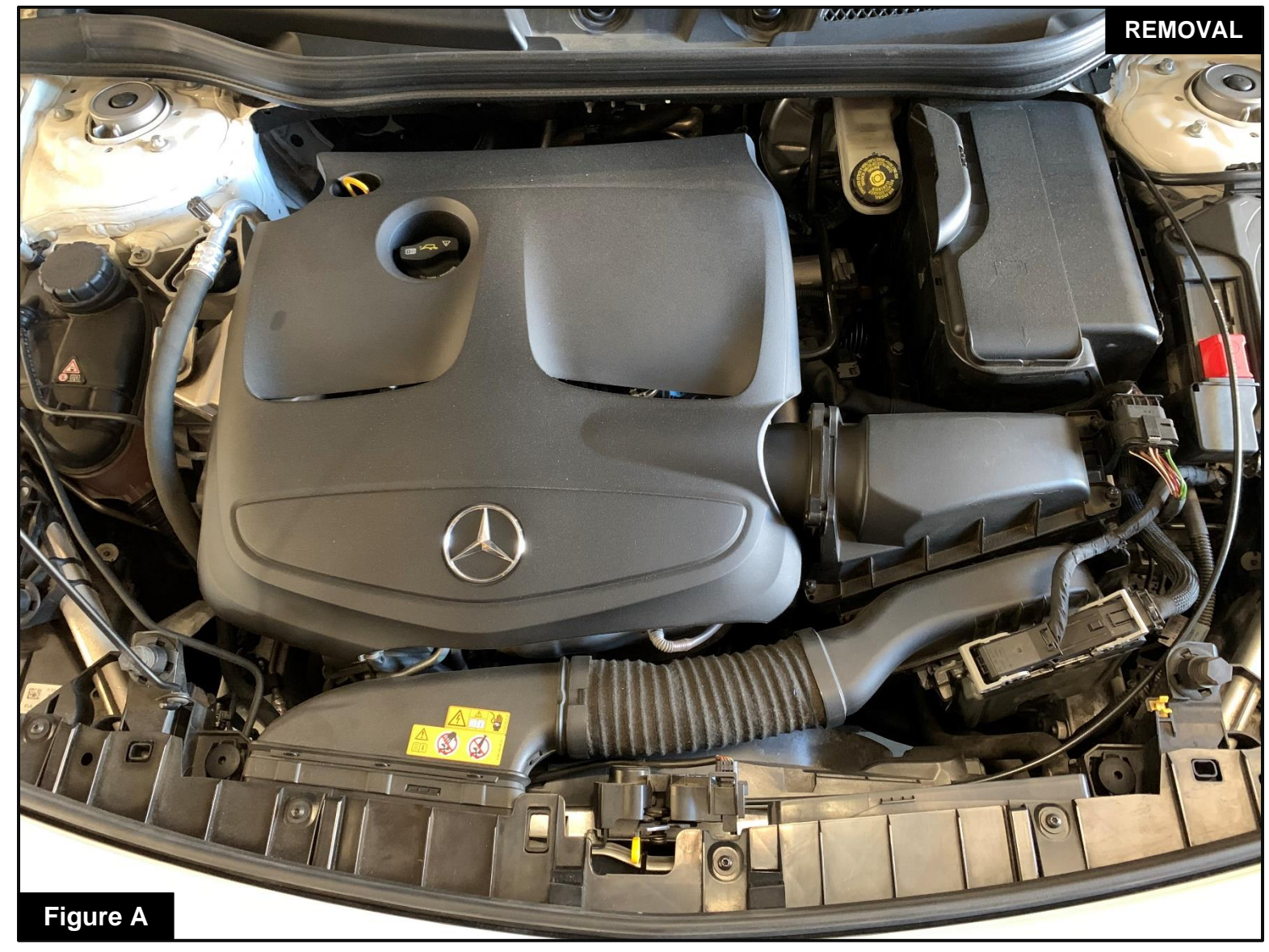
Refer to Figure A for Step 1