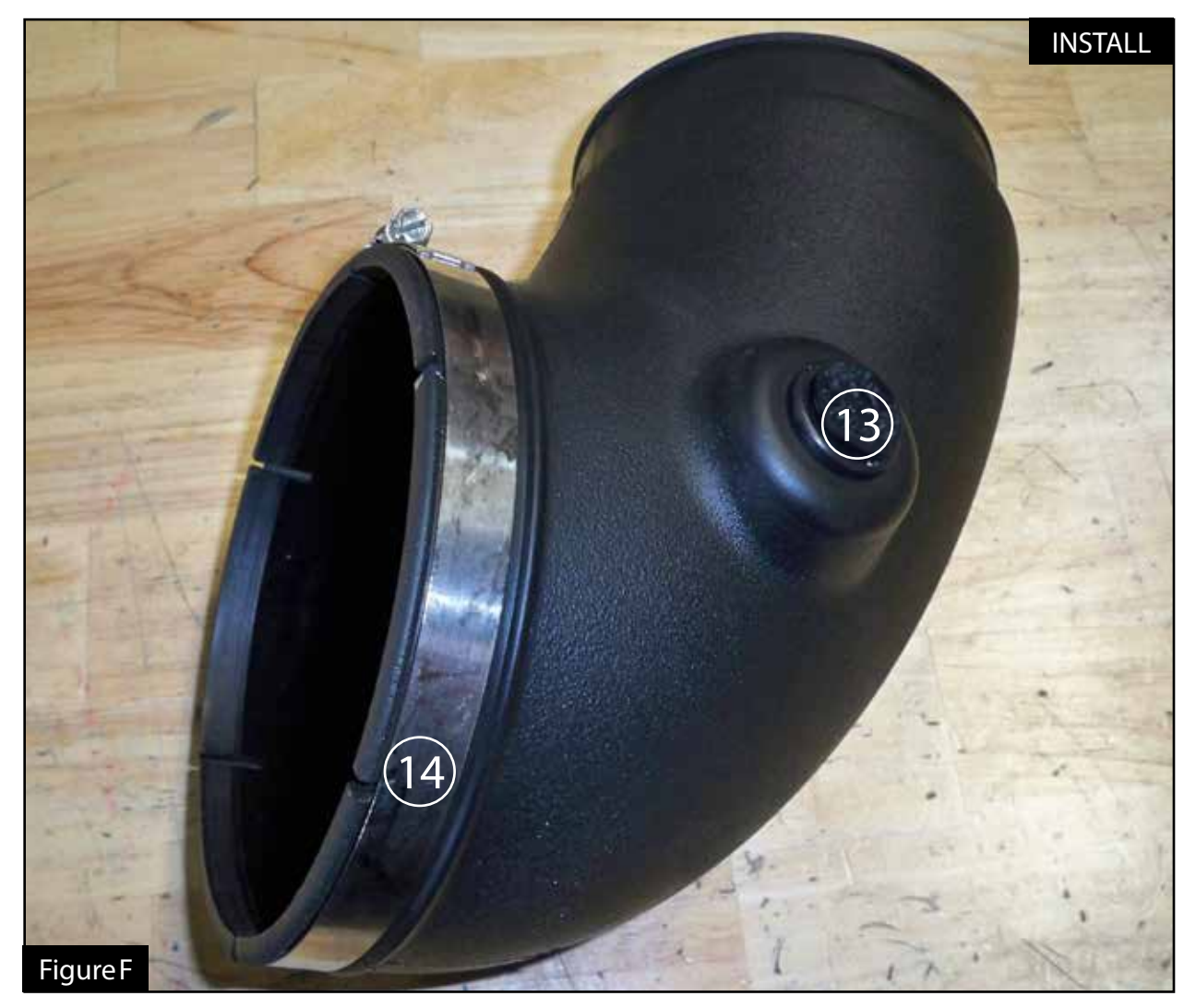
Refer to Figure F for Steps 10-11

Step 10: Remove the filter minder and grommet from factory airbox. Install the grommet into the aFe elbow tube and then push in the filter minder. If you choose not to use the filter minder or your vehicle is not equipped with one, just plug off the hole with the supplied plug with tab (13).