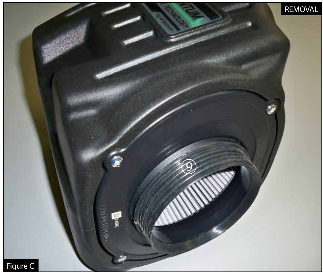
Refer to Figure C for Steps 6-7

Step 6: Slide the aFe filter into the aFe housing. Install the aFe filter using a #3 Phillips screwdriver. Tighten all (x4) screws.