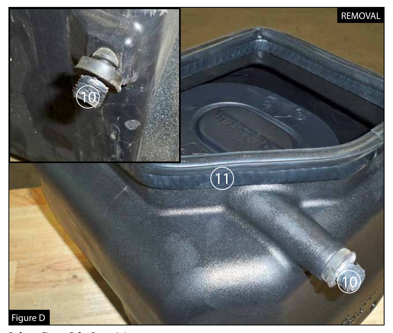
Refer to Figure D for Steps 8-9

Step 8: Remove the retaining plug ① from the bottom of the factory airbox and transfer it to the aFe housing.