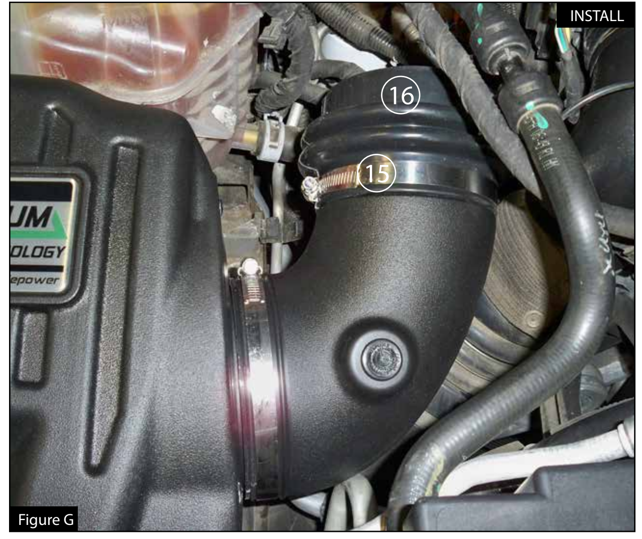
Refer to Figure G for Steps 12-13

Step 12: Install the aFe elbow tube assembly onto the filter coupling. Align elbow tube but do not tighten the clamp.