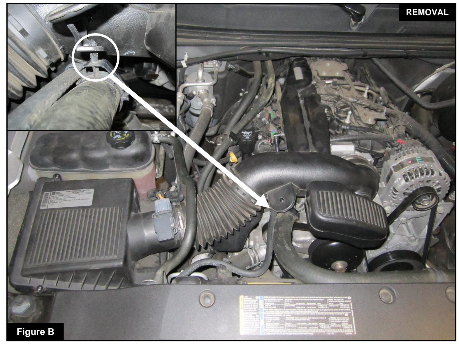
Refer to Figure B for Step 4