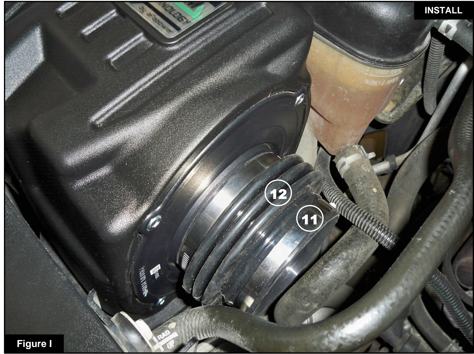
Refer to Figure I for Step 15