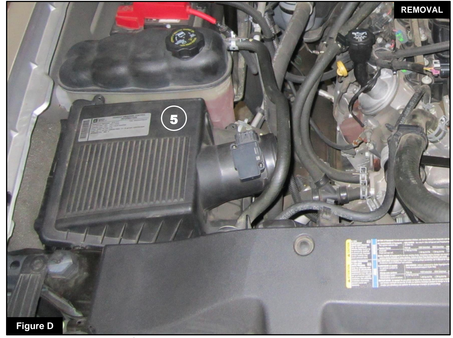
Refer to Figure D for Step 7