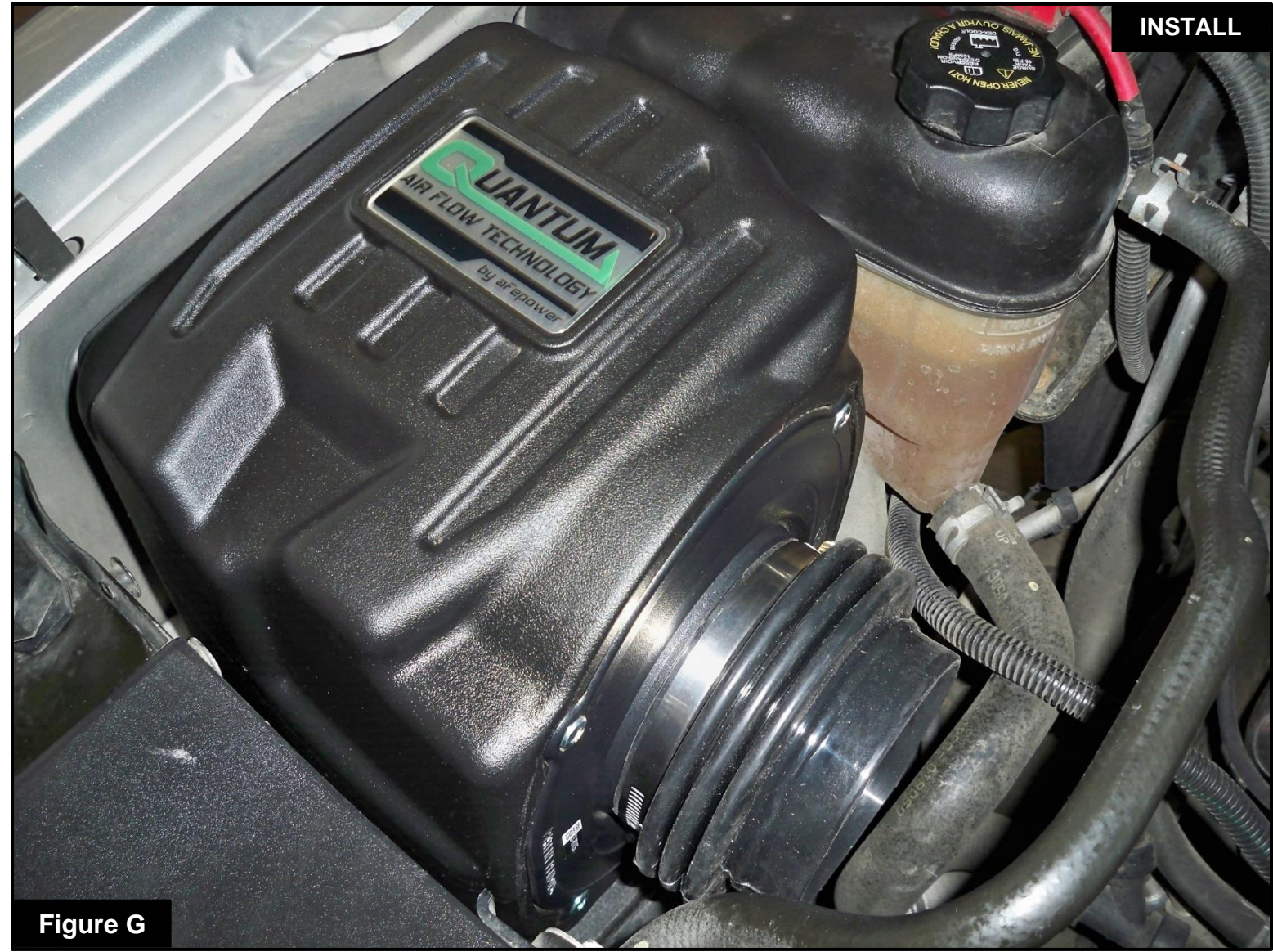
Refer to Figure G for Step 12