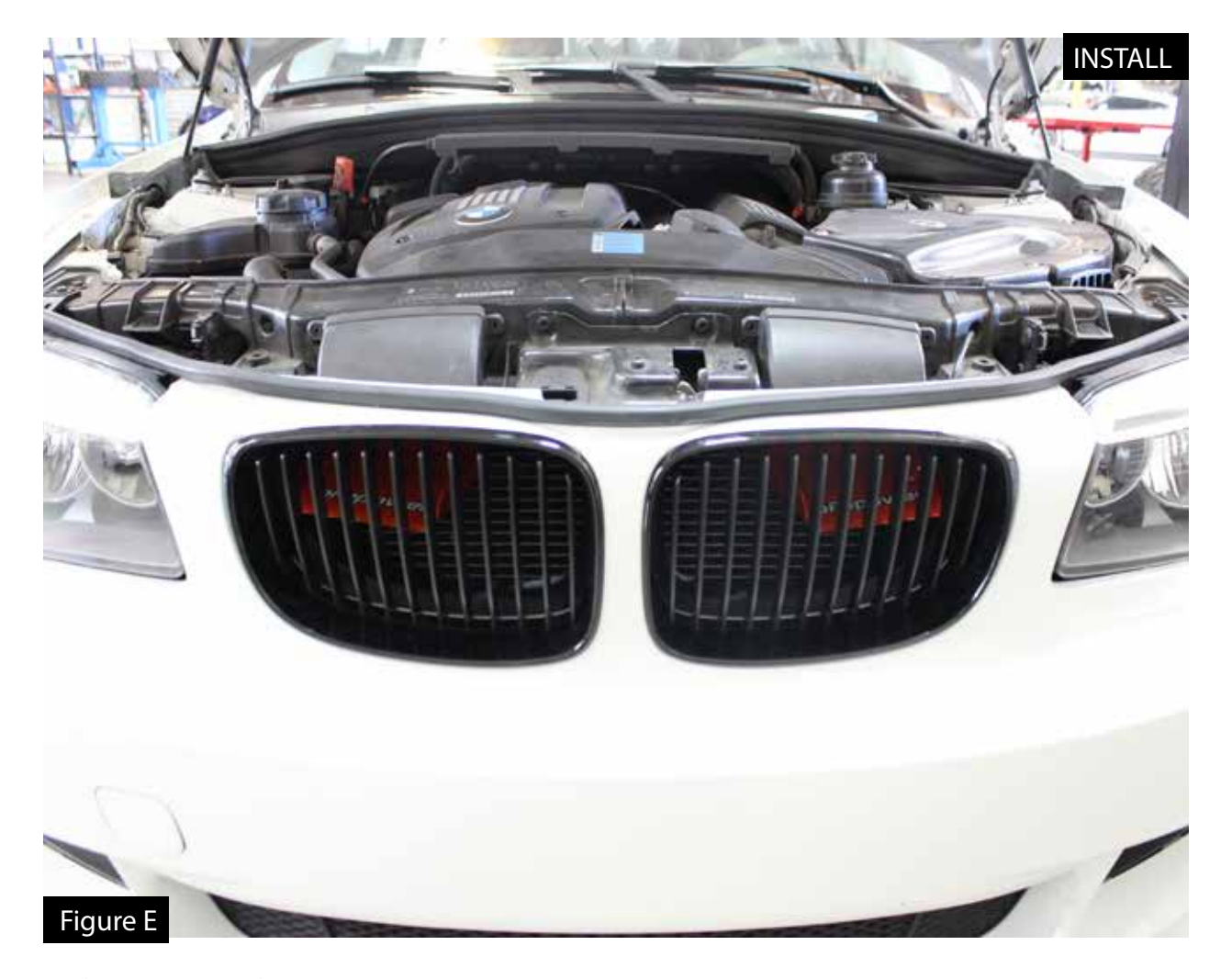
Refer to Figure E for step 6

Step 6: Re-install T20 screws removed at step 1. Installation is now complete! Thank you for choosing aFe Power!