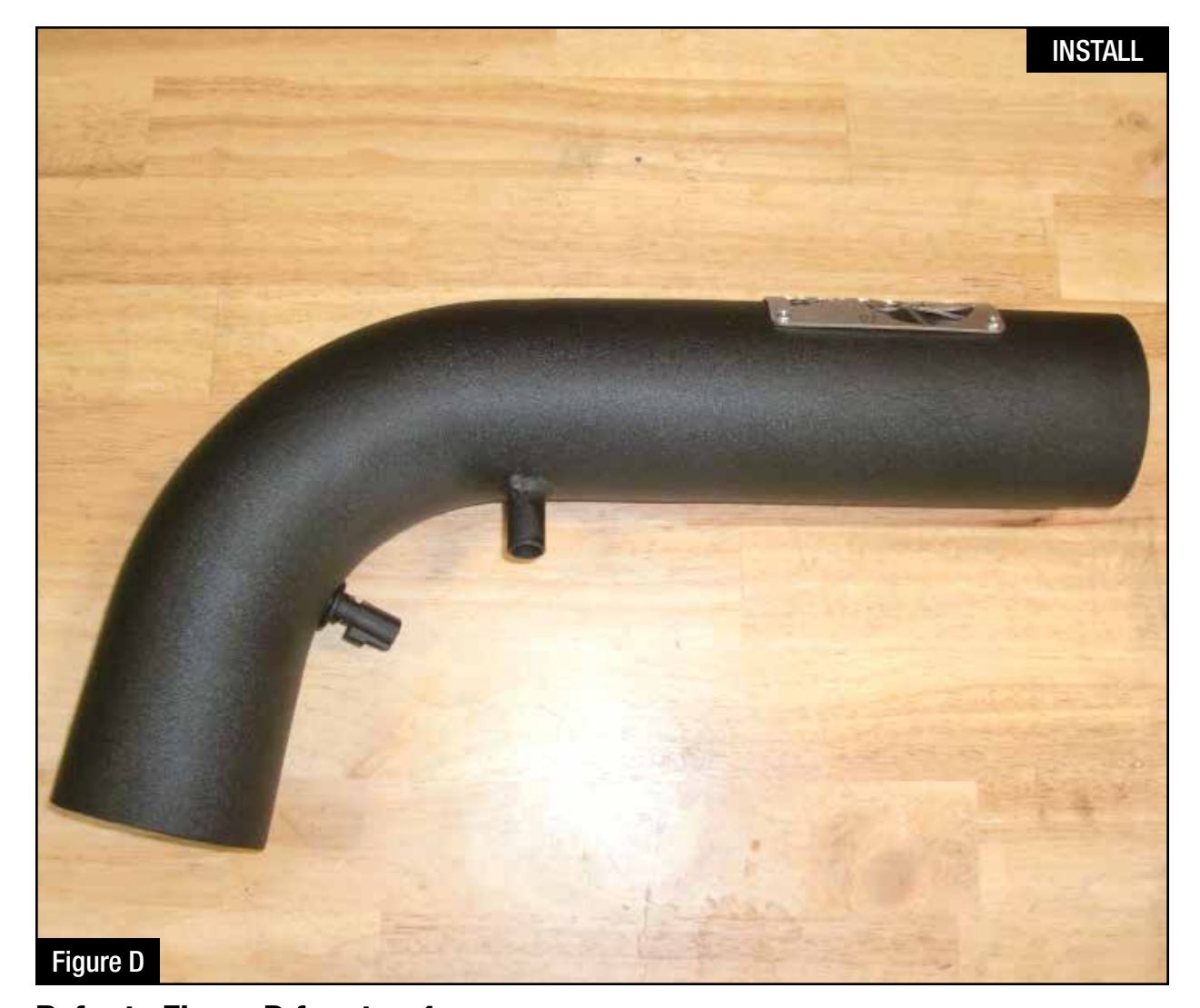
Refer to Figure D for step 4

Step 4. Install the supplied grommet in the aFe air intake tube. Insert the temperature sensor in the grommet. Install the supplied crankcase breather hose on the aFe air intake tube.