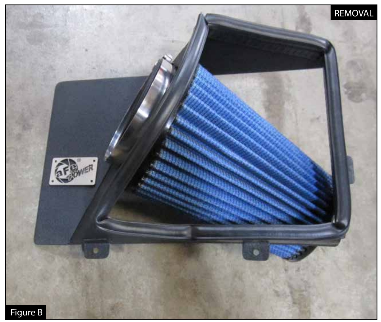
Refer to Figure B for step 6

Step 6: Install the aFe filter onto the aFe housing along with trim seal. Make sure housing is secured in filter retention groove.