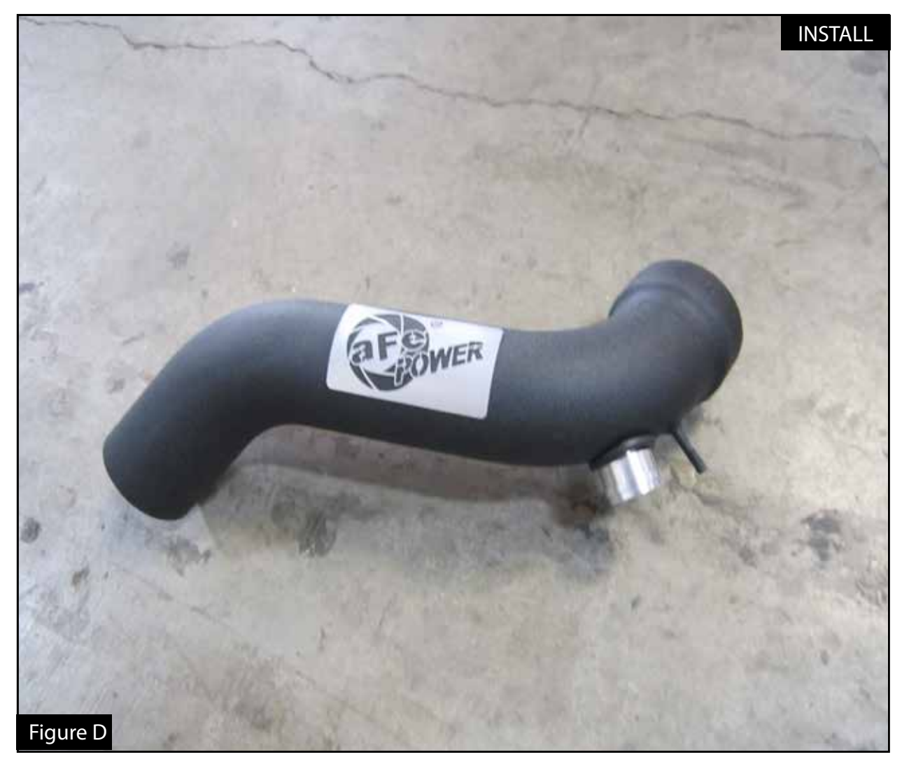
Refer to Figure D for step 9