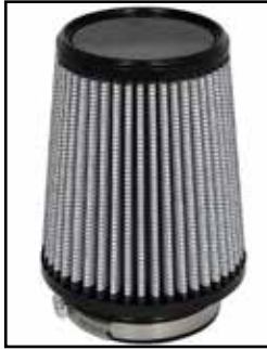
Pro DRY S Air Filter