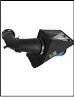
Cold Air Intake