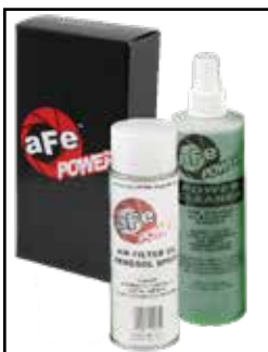
Blue Aerosol Restore Kit