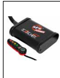
SCORCHER GT Module

P/N: 49-36331-B (Blk. Tips) 49-36331-P (Pol. Tips)