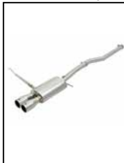
Cat-Back Exhaust System

P/N: 49-36331-B (Blk. Tips) 49-36331-P (Pol. Tips)