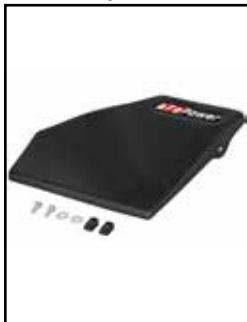
Intake System Cover

P/N: 54-12868-B (Black) 54-12868-C (Carbon Look)