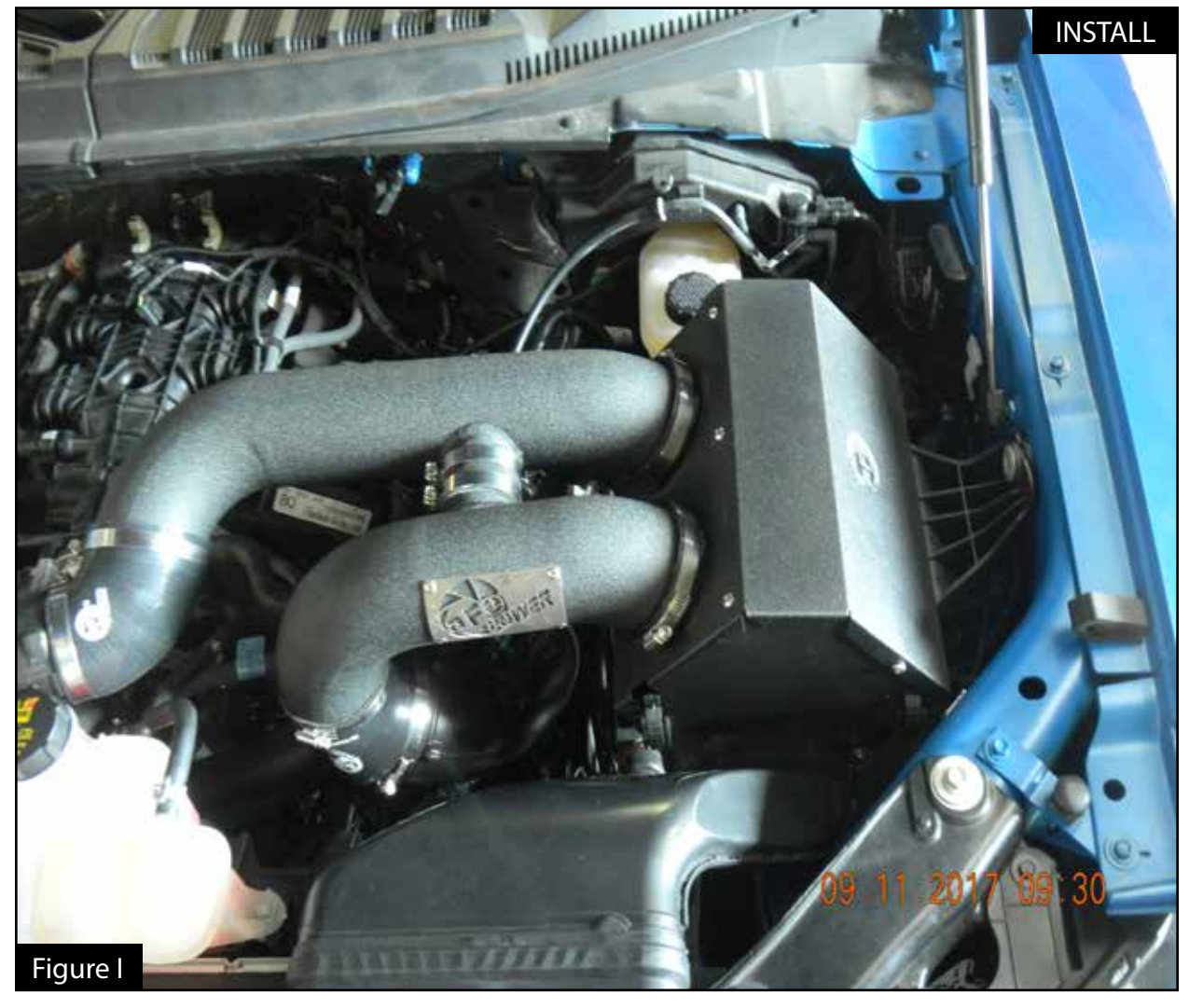
Refer to Figure I for Step 18.

Step 18: Make sure all clamps and screws are tight. Your installation is now complete.