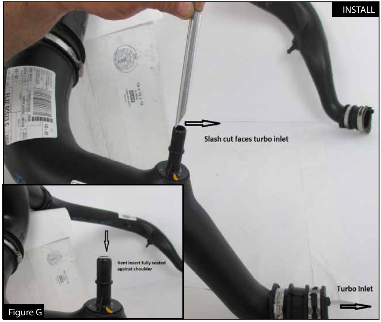
Refer to Figure G for Step 15