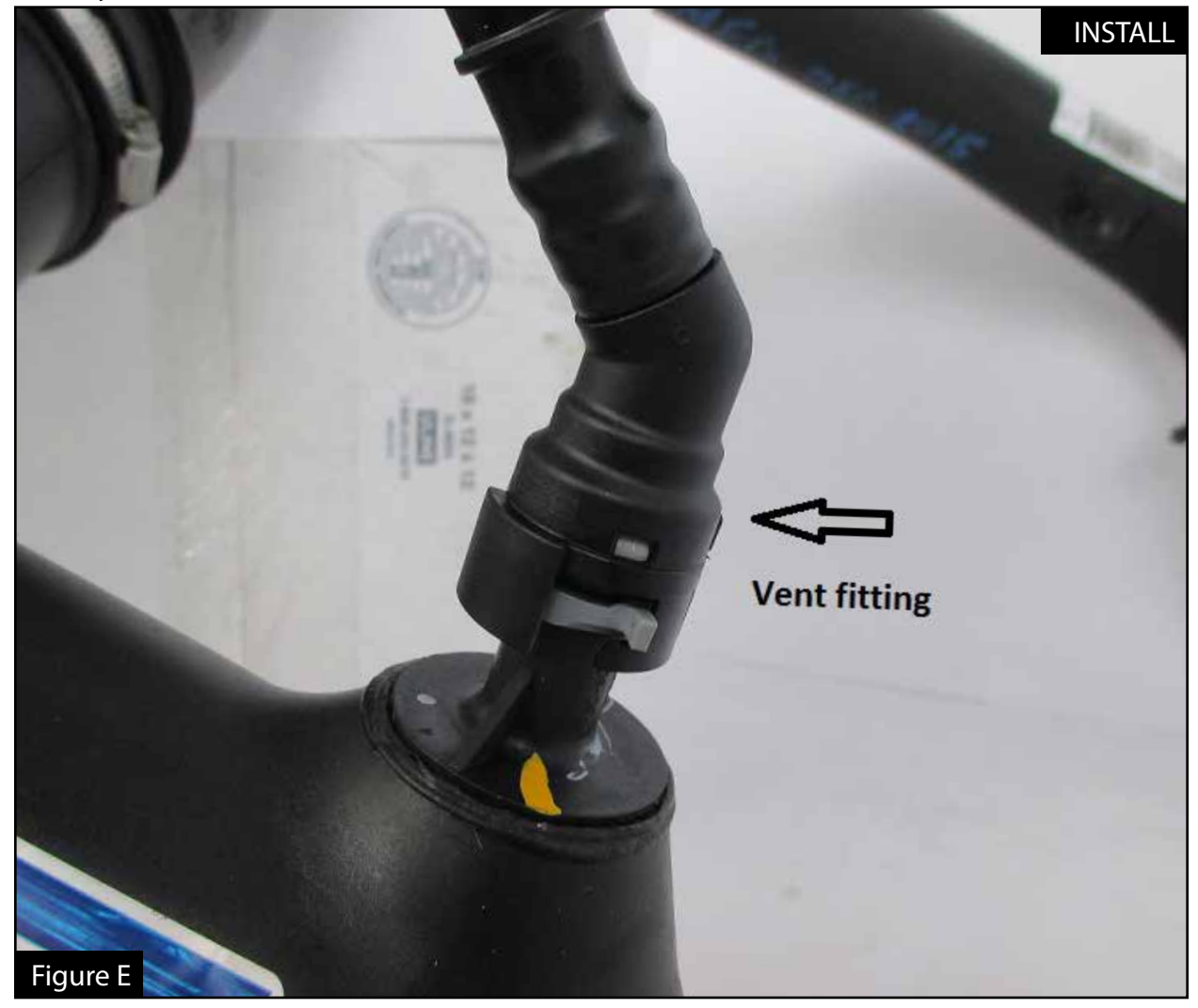
Refer to Figure E for Step 13.