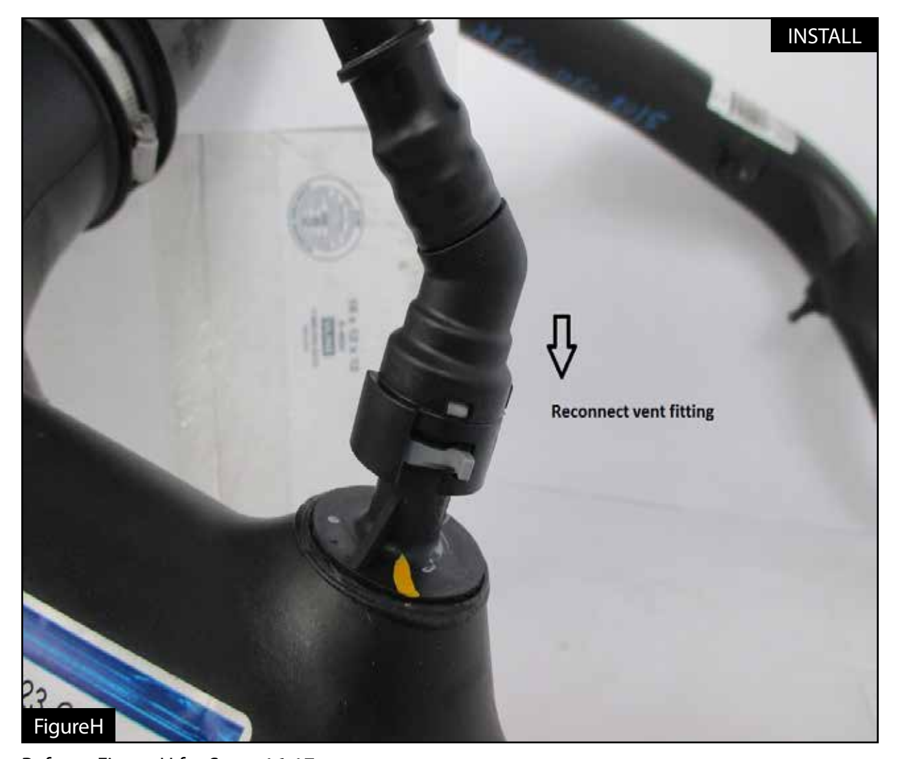
Refer to Figure H for Steps 16-17.