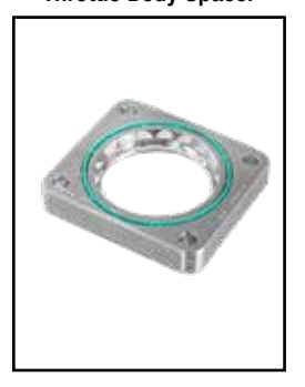
P/N: 46-33018 (Explorer Only!)