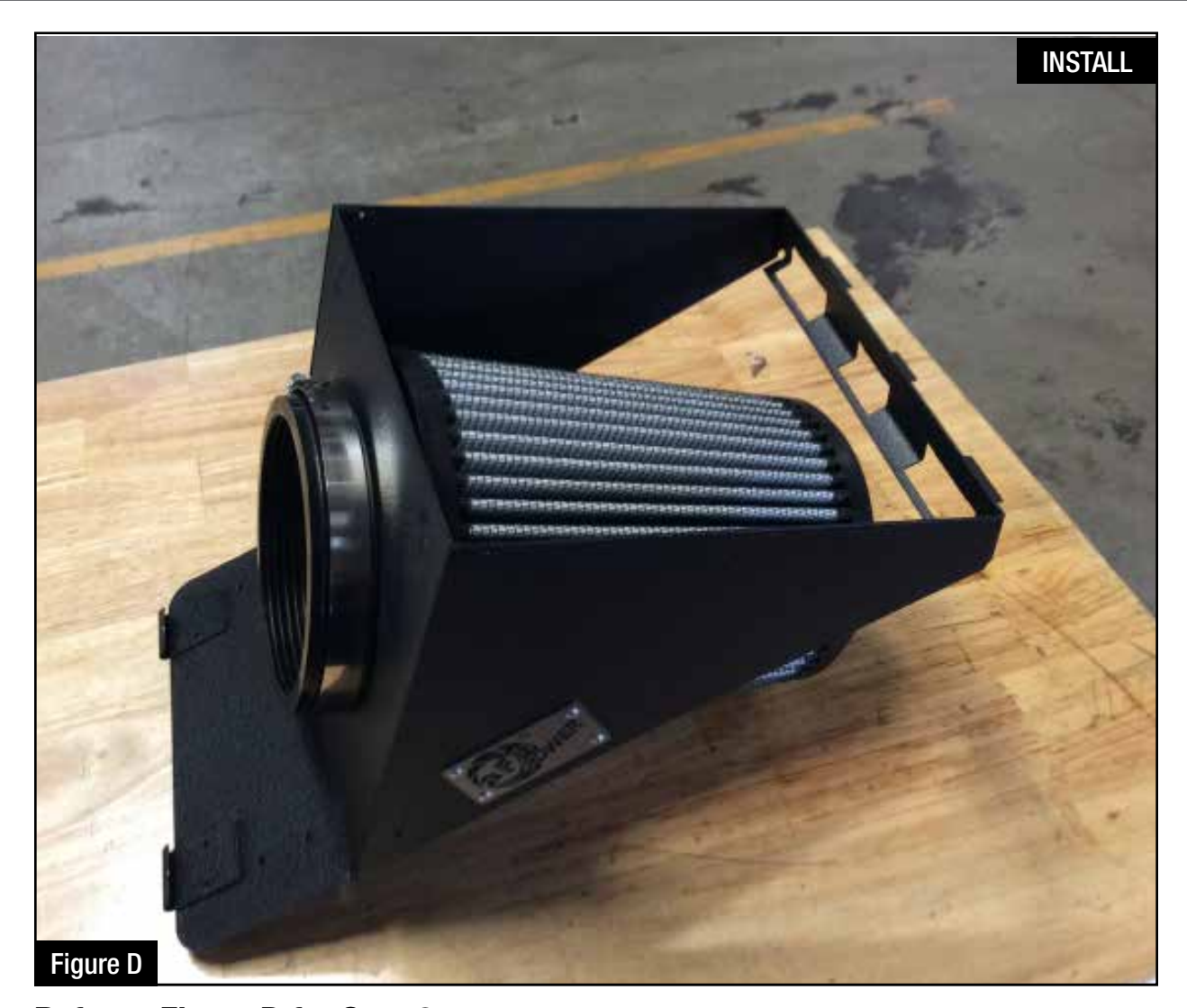
Refer to Figure D for Step 8.

Step 8: Install the filter into the housing.