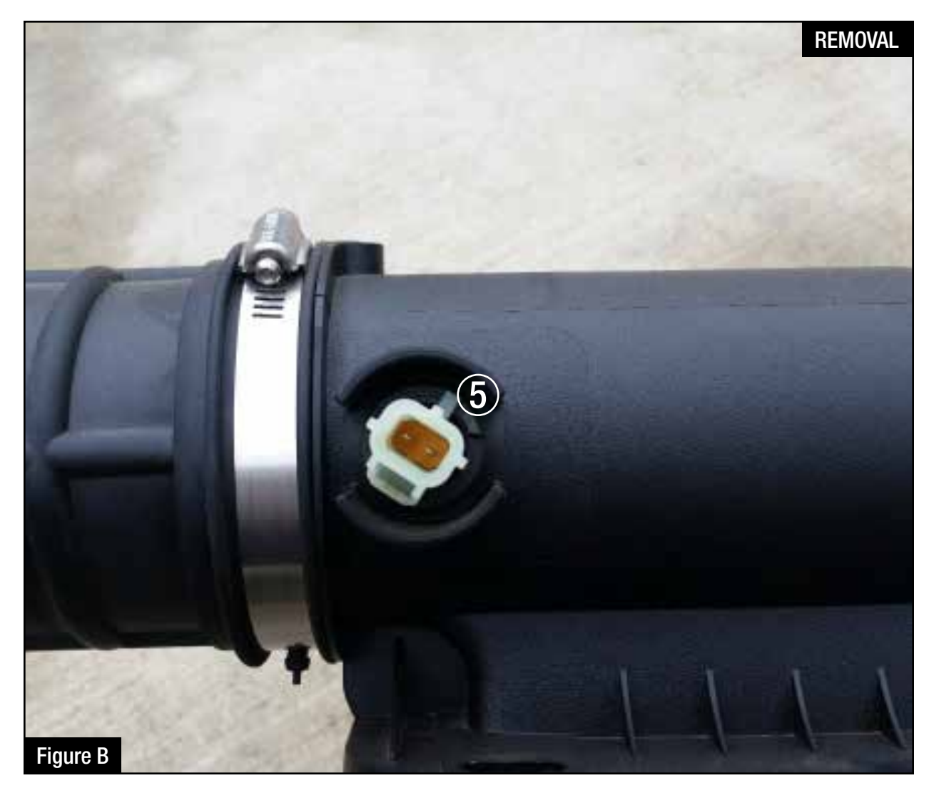
Refer to Figure B for Step 5