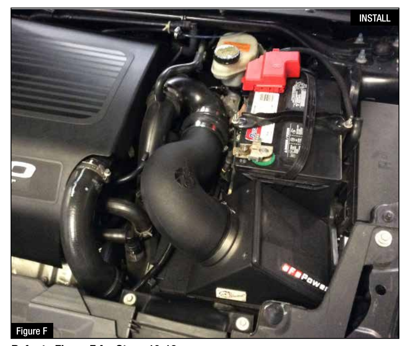
Refer to Figure F for Steps 10-12

Step 10: Install coupler onto inlet tube with the supplied clamps, but do not fully tighten.