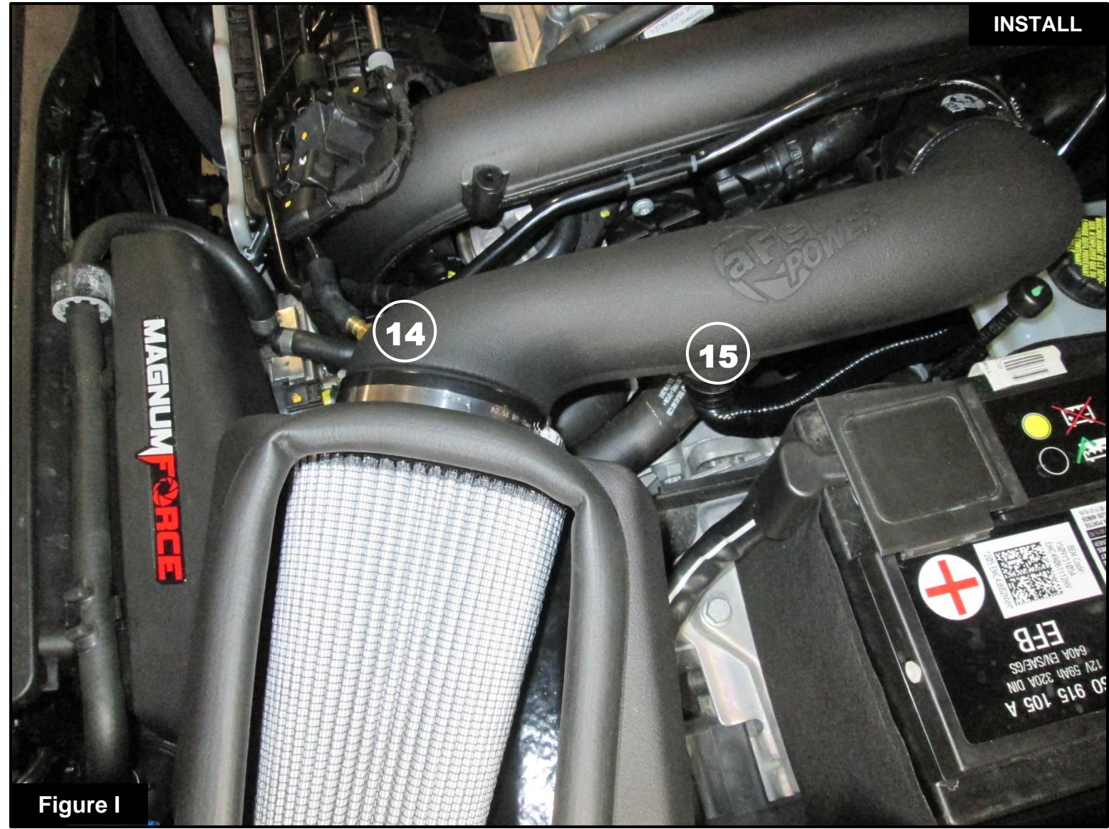
Refer to Figure I for Steps 15-16

Step 15: Reconnect the crankcase breather line (14) to the fitting on the side of your intake tube.