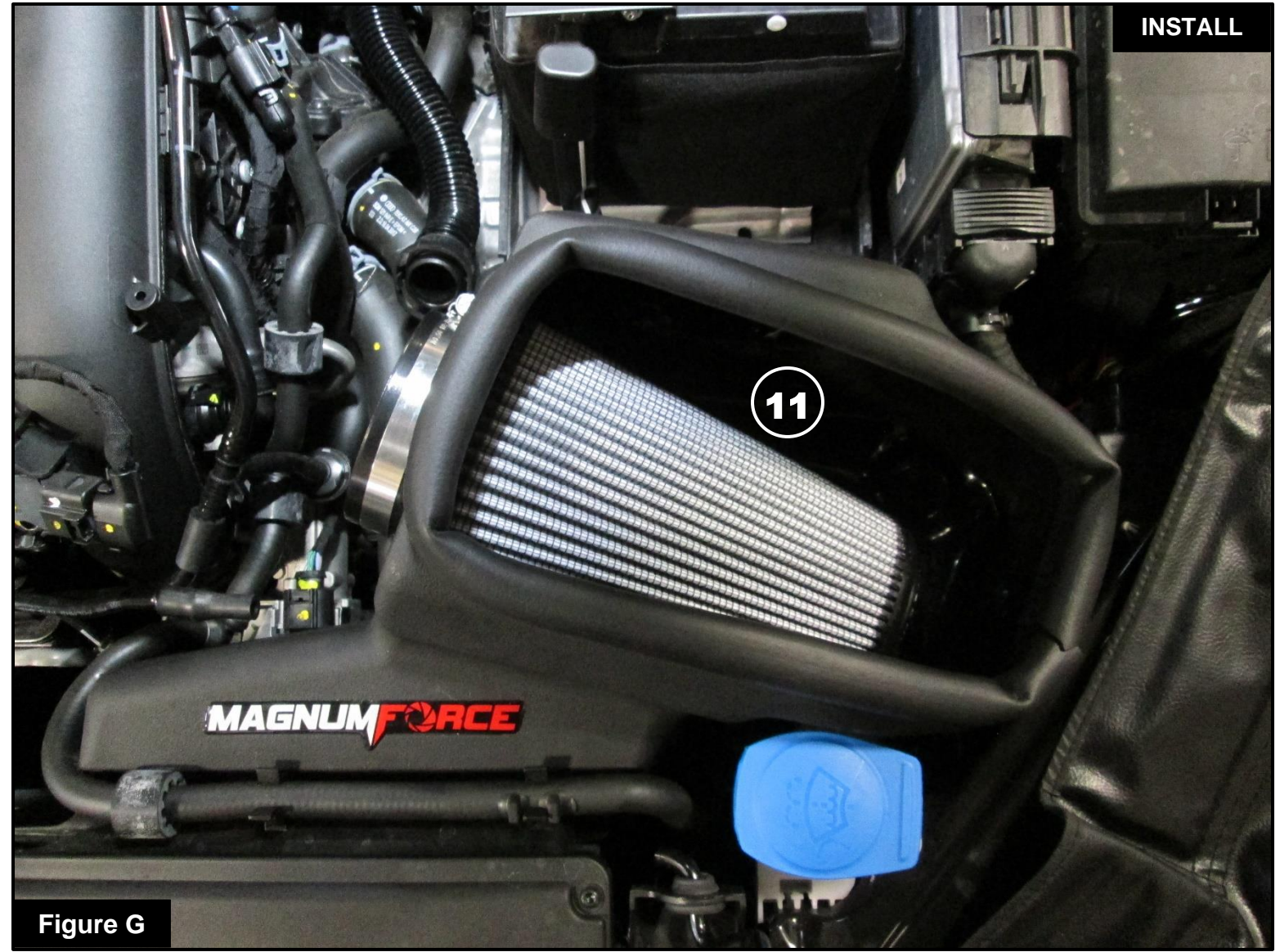
Refer to Figure G for Step 13

Step 13: Install your aFe Power air filter 11 into the housing through the top opening, ensuring that the retention bumps are on the outside of the housing. Place the filter clamp loosely on the filter opening.