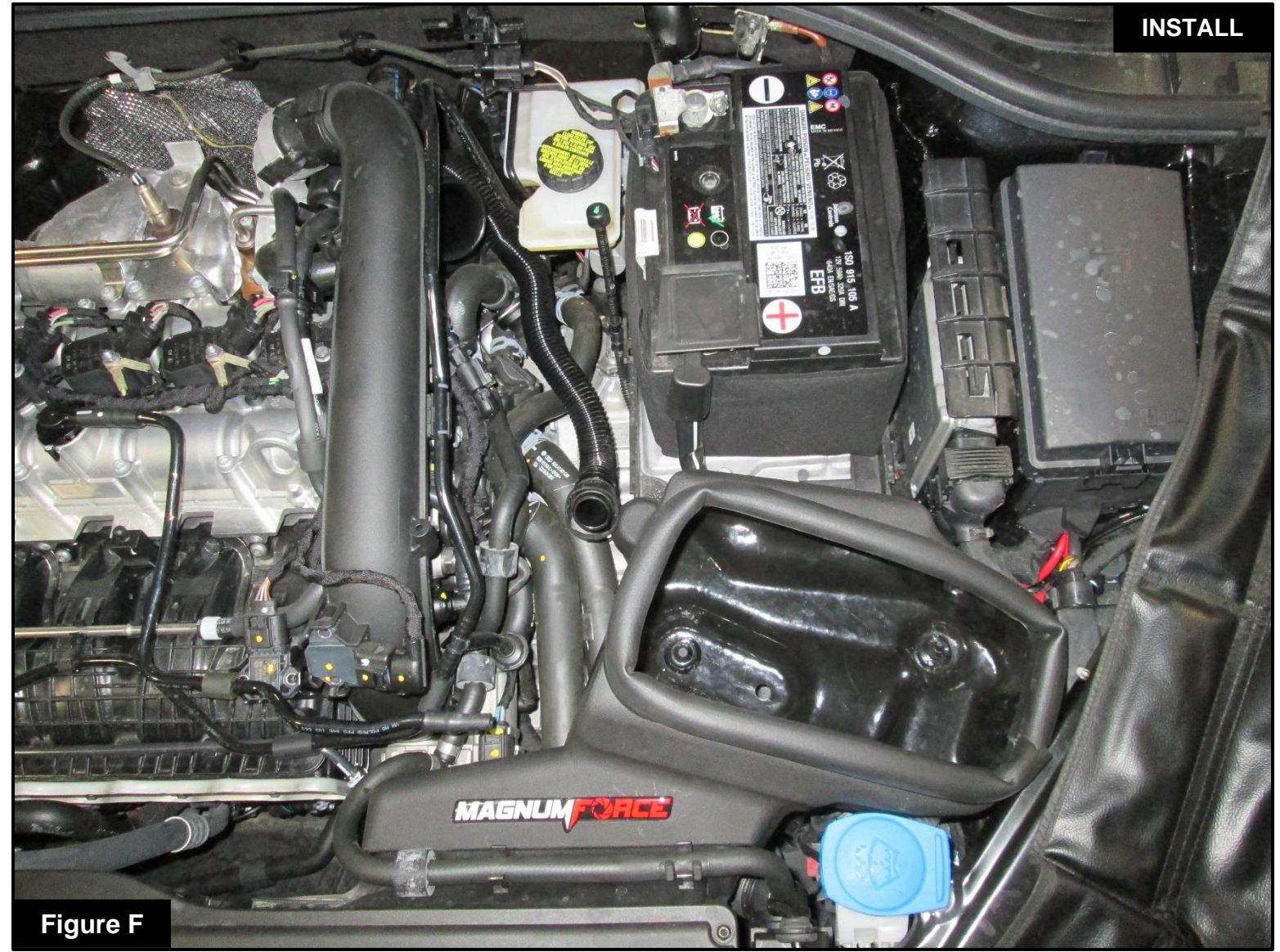
Refer to Figure F for Step 12

Step 12: Install your aFe Power filter housing into the vehicle by lining up the three grommets on the mounting pins on the factory battery tray. Press firmly until all 3 grommets are engaged.