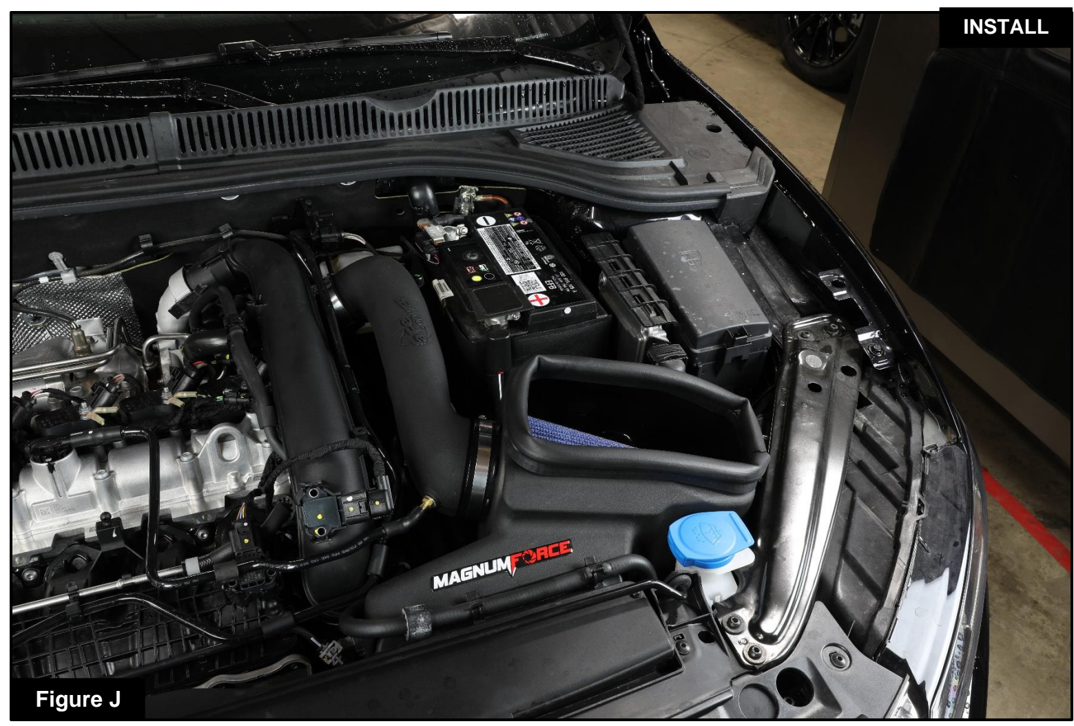
Refer to Figure J for Step 17