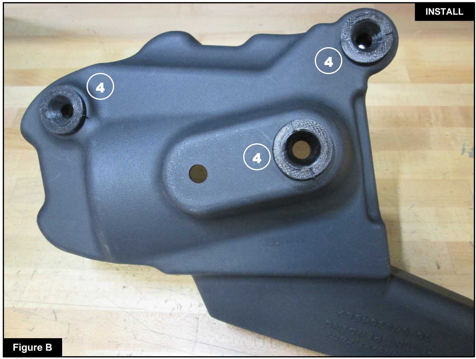
Refer to Figure B for Step 5

Step 5: Install the supplied grommets 4 in the three mounting holes on the bottom of your aFe Power housing as shown.