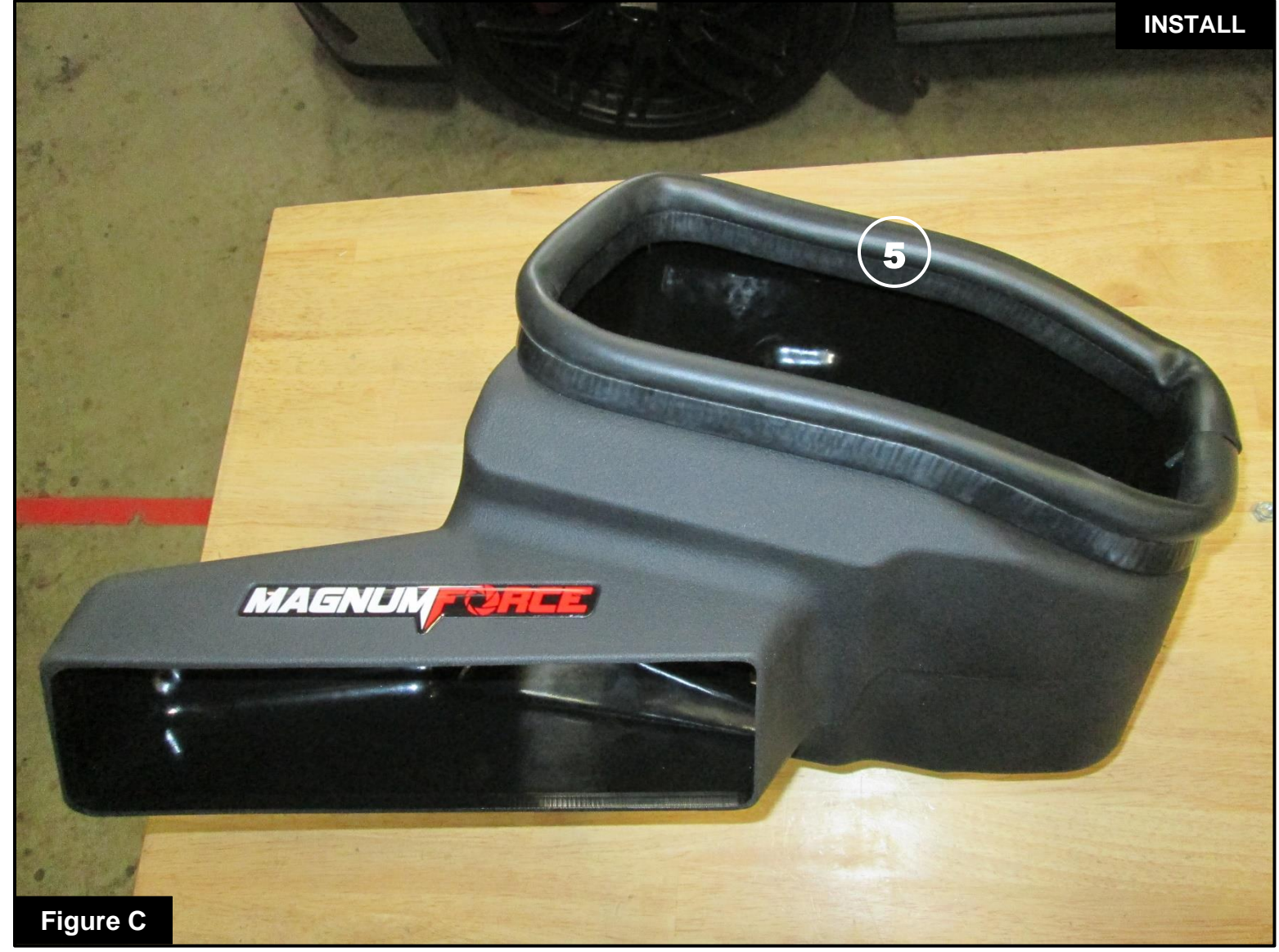
Refer to Figure C for Step 6

Step 6: Install the supplied seal trim 5 along the top opening of the housing as shown. Trim to fit as necessary.