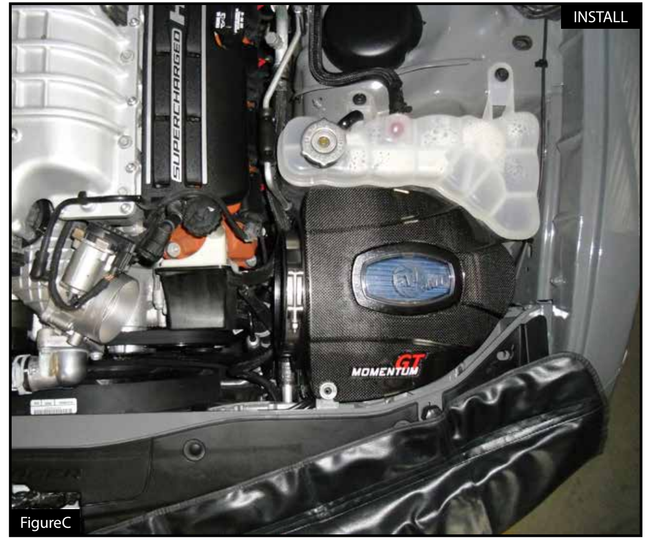
Refer to Figure C for Steps 4-5

Step 4: Re-install housing into the vehicle and make sure the inlet scoop connects to the headlight hole.