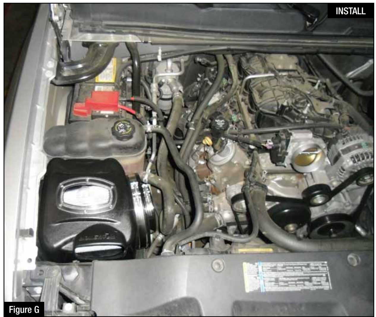
Refer to Figure G for step 14

Step 14: Install the aFe air box into the vehicle by firmly pushing it into the factory mounting grommets.