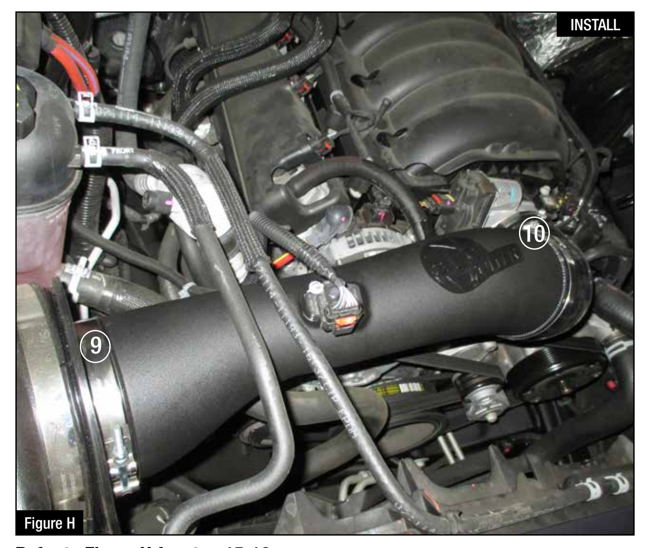
Refer to Figure H for step 15-16

Step 15: Install the intake tube into the vehicle. Slide the tube in the filter (9), then the coupling over the throttle body (10).