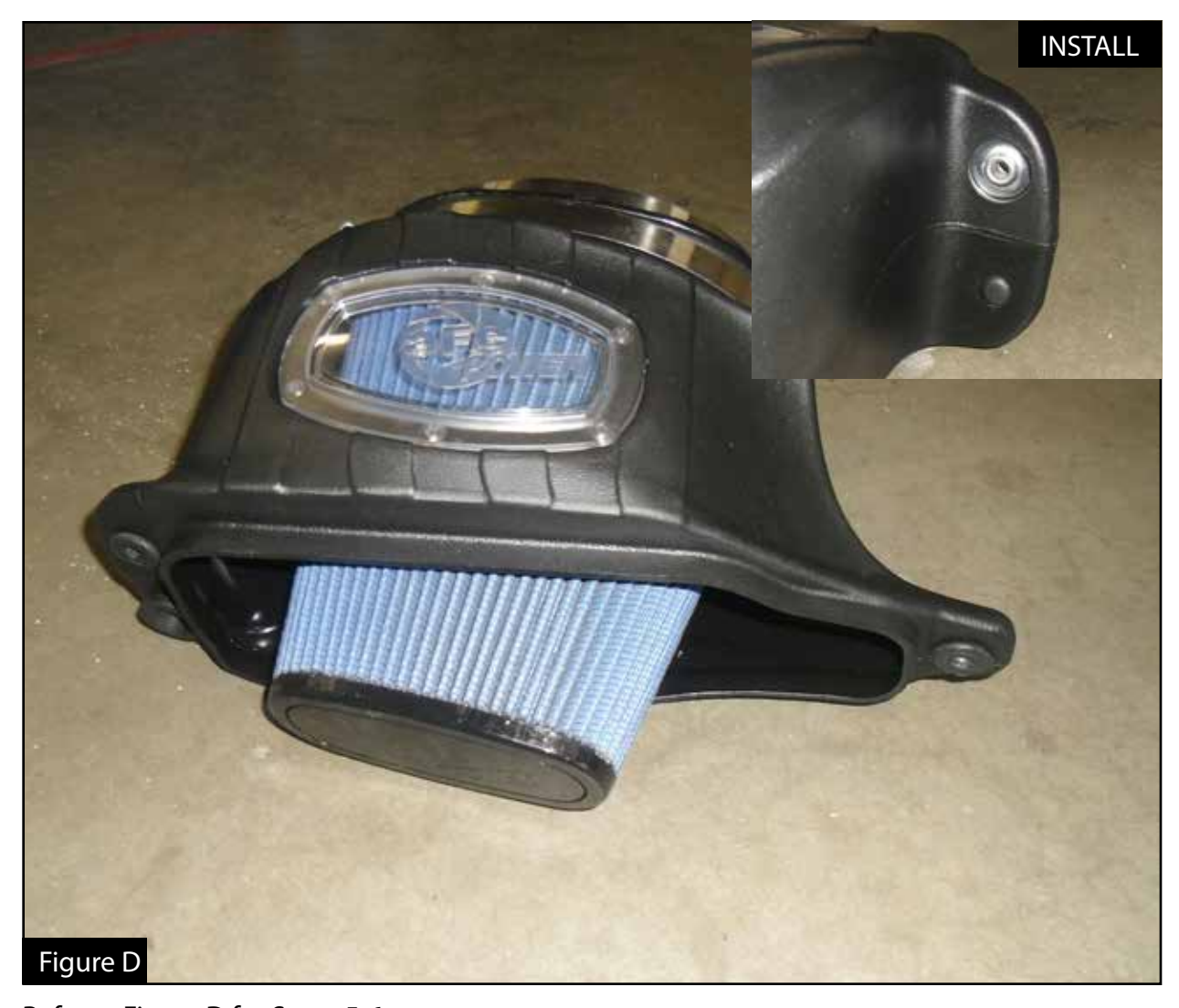
Refer to Figure D for Steps 5-6

Step 5: Transfer the three mounting grommets from the factory air box to the aFe POWER Housing. Step 6: Slide the filter into the housing and install the T-bolt clamps. Do not tighten yet.