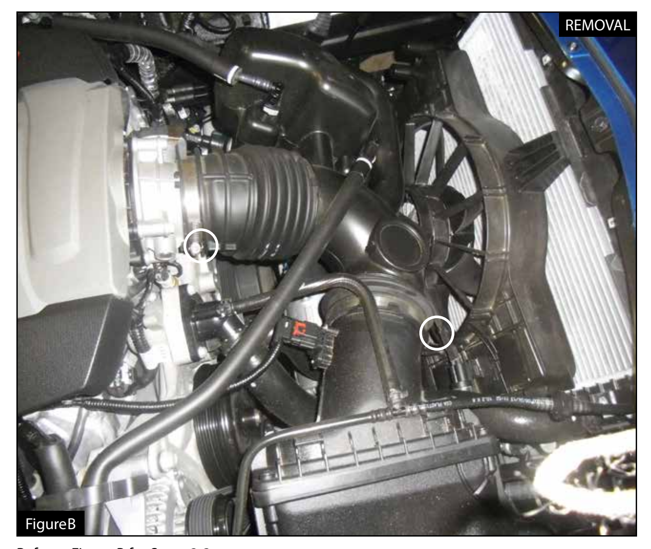
Refer to Figure B for Steps 2-3

Step 2: Disconnect the Mass Air Flow (MAF) Sensor harness.