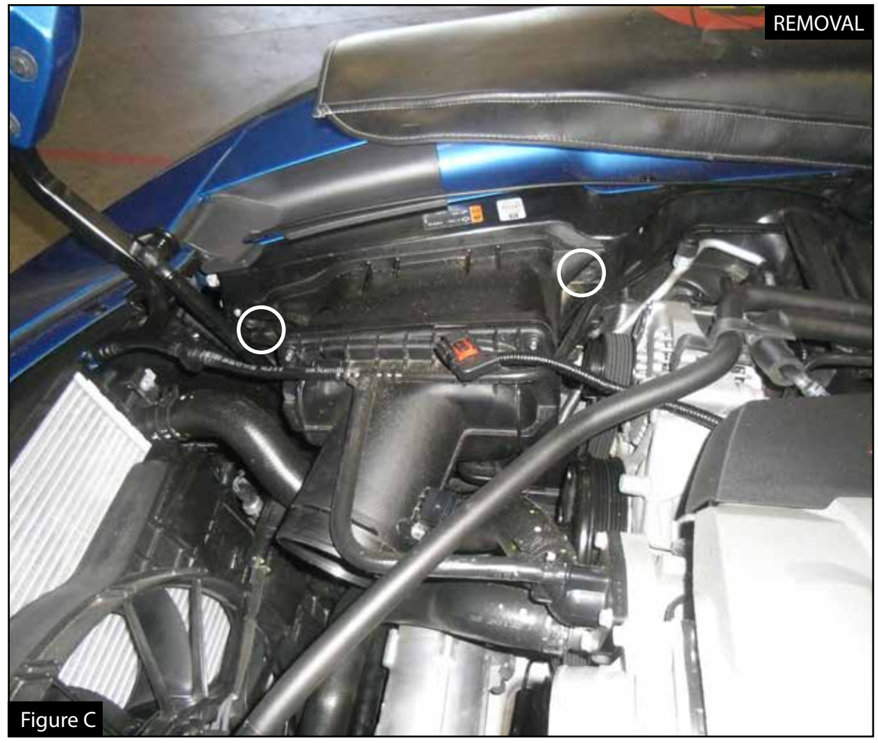
Refer to Figure C for Step 4