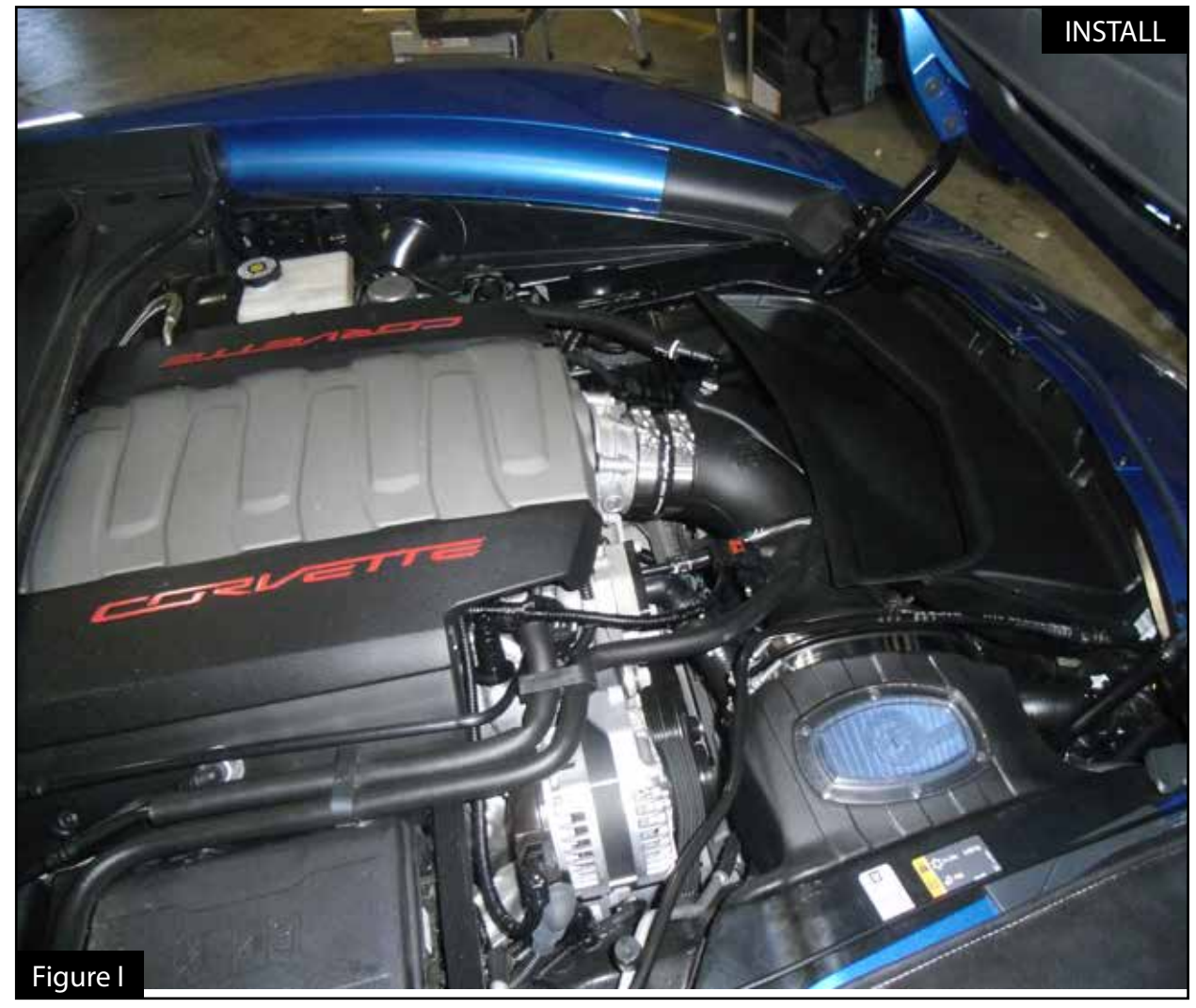
Refer to Figure I for Steps 14-15

Step 14: Re-install the factory radiator air outlet.