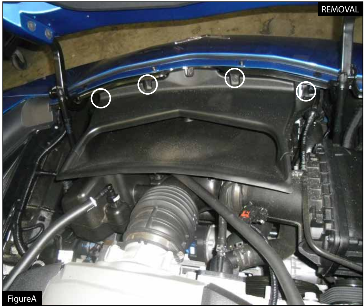
Refer to Figure A for Step 1