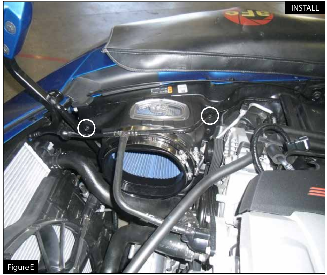
Refer to Figure E for Step 7

Step 7: Install the aFe POWER filter/housing assembly into the vehicle. Push it on the factory stud and secure it using the two factory 10 mm screws removed at step 4.