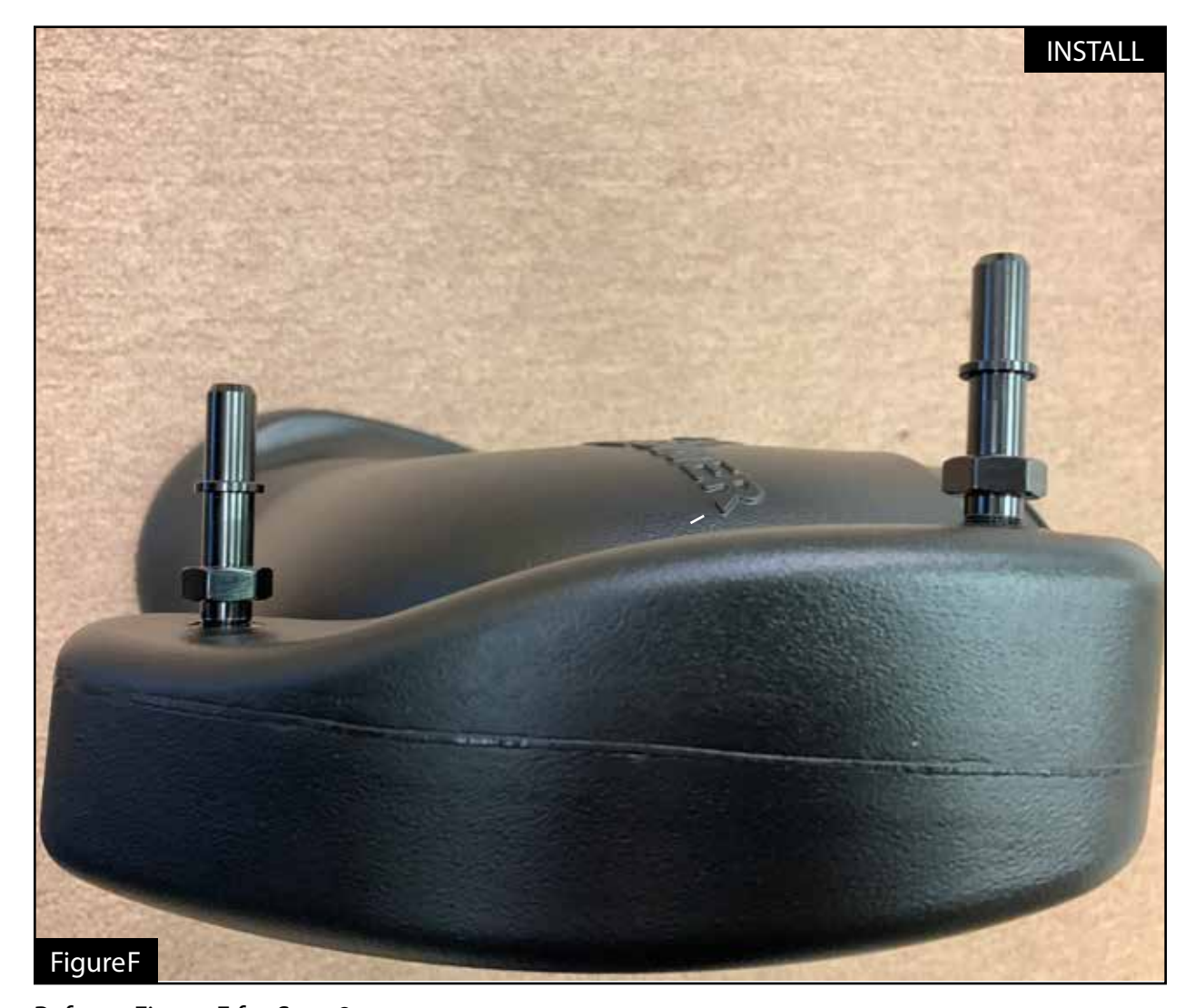
Refer to Figure F for Step 8

Step 8: Screw the two vent fittings into the NPT inserts on the aFe POWER tube. If vehicle is equipped with only one vent fitting, use the supplied NPT plug to close off the extra hole.