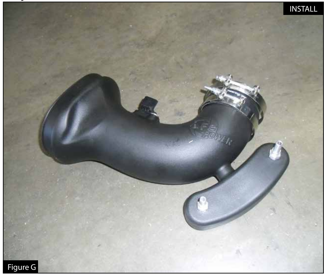
Refer to Figure G for Steps 9-10

Step 9: Remove the MAF sensor from the factory air box. Install it on the aFe POWER tube using factory O-ring and supplied m4 screws.