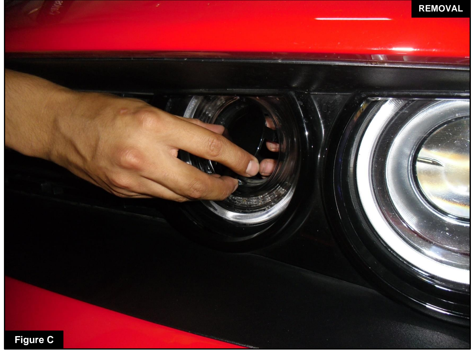
Refer to Figure C for Step 7