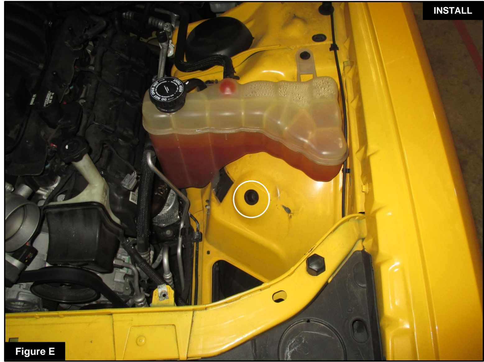
Refer to Figure E for Step 10

Step 10: If the mounting grommet came with the factory housing, transfer it to the SRT Hellcat housing or place it into the hole on the vehicle. This will prevent the housing from rattling.