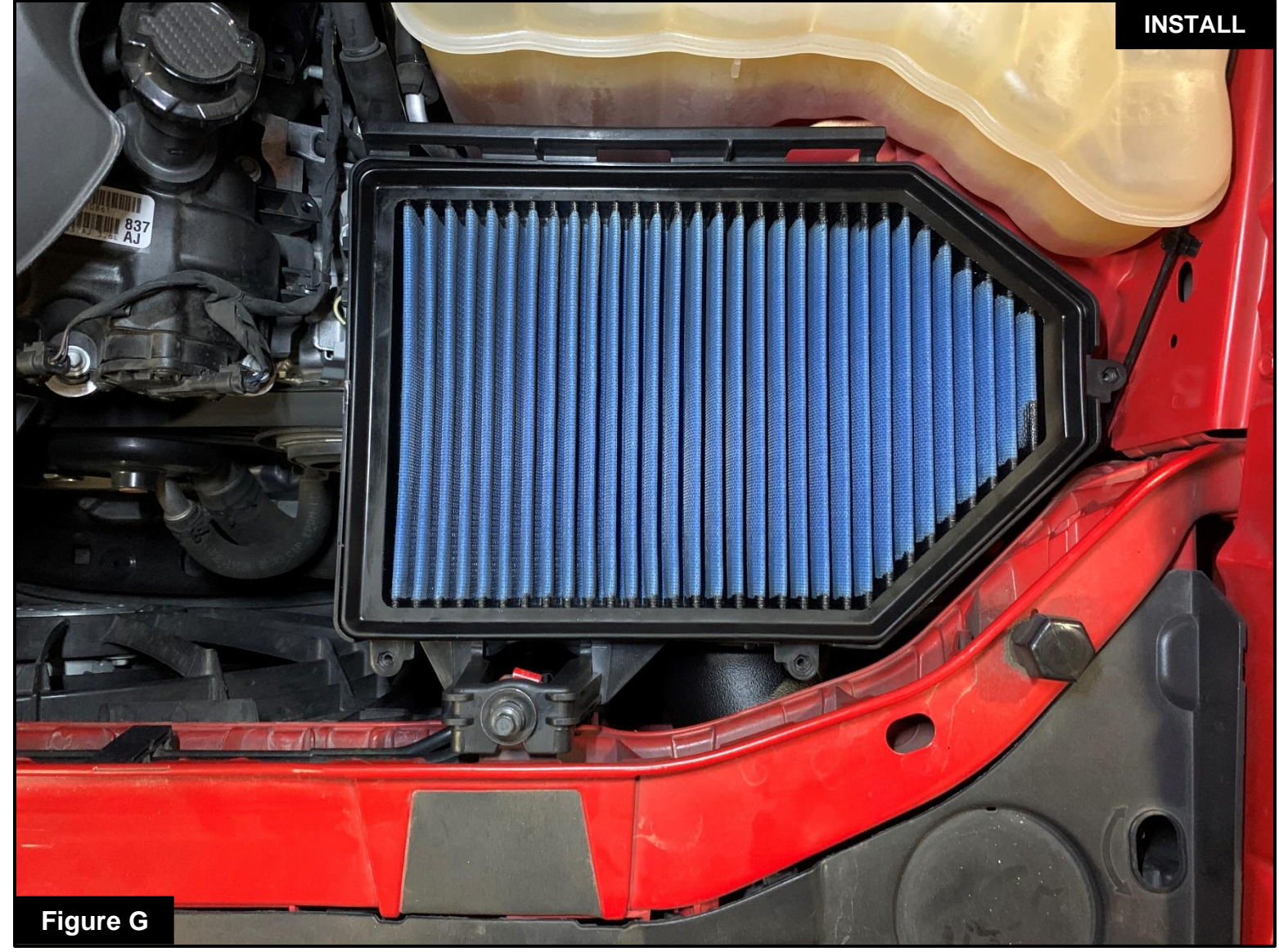
Refer to Figure G for Step 13