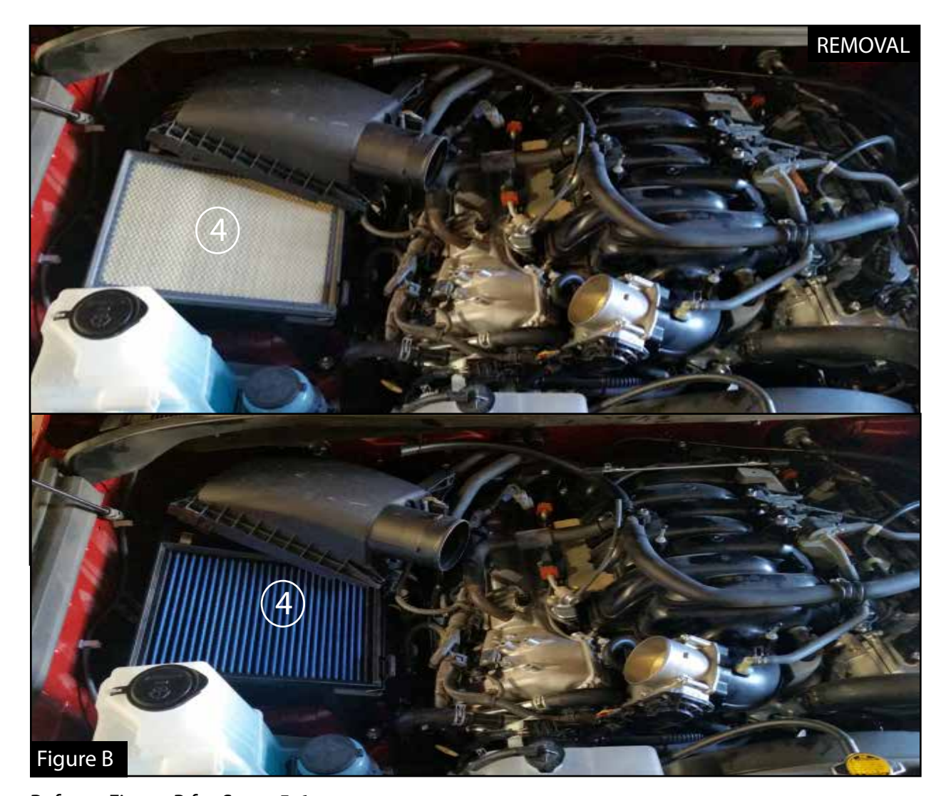
Refer to Figure B for Steps 5-6