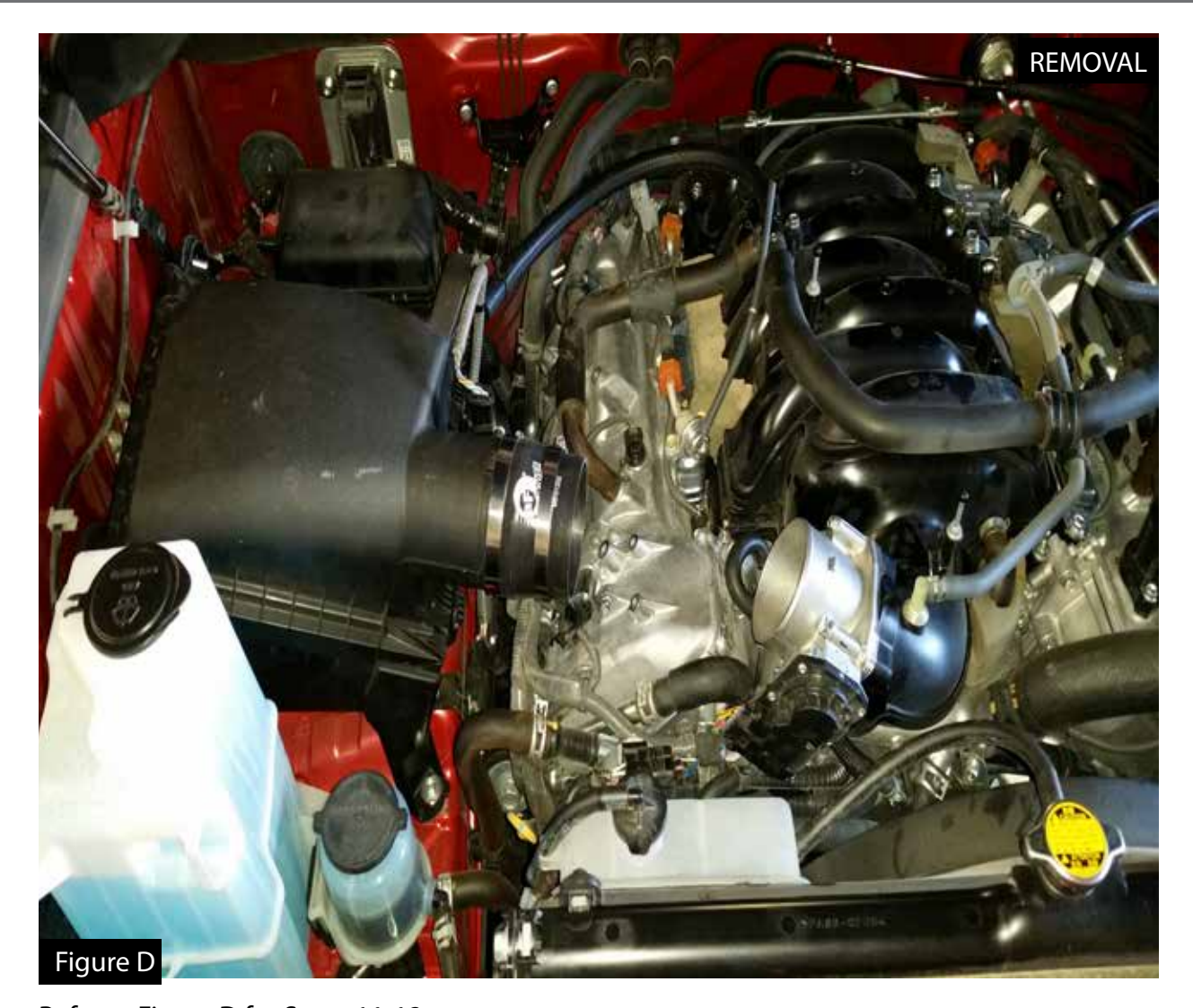
Refer to Figure D for Steps 11-12

Step 11: Install the provided reducer silicone coupling to the factory housing.