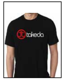
P/N: 40-30332 (M) 40-30333 (L) 40-30334 (XL)

To purchase any of the items above, view airflow charts, dyno graphs, photos, and video; please go to aFepower.com.