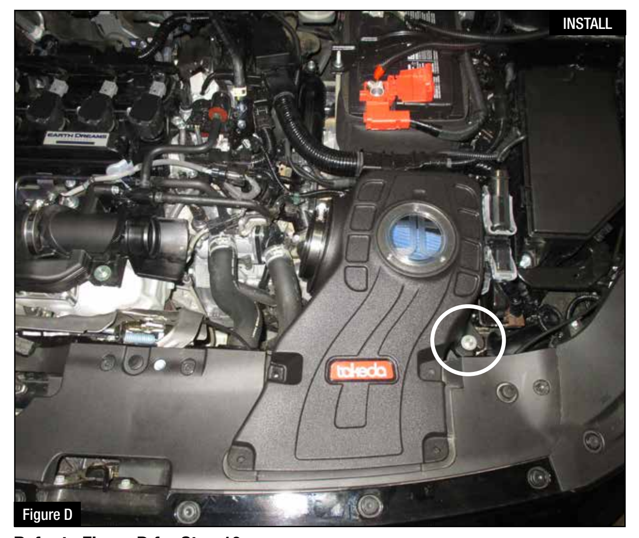
Refer to Figure D for Step 10