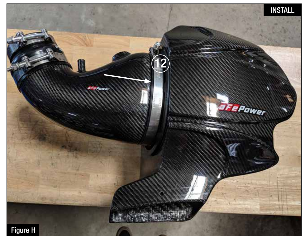
Refer to Figure H for Step 20