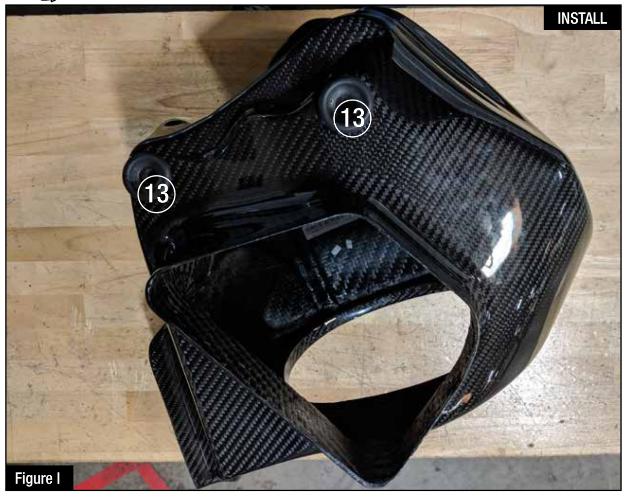
Refer to Figure I for Step 21