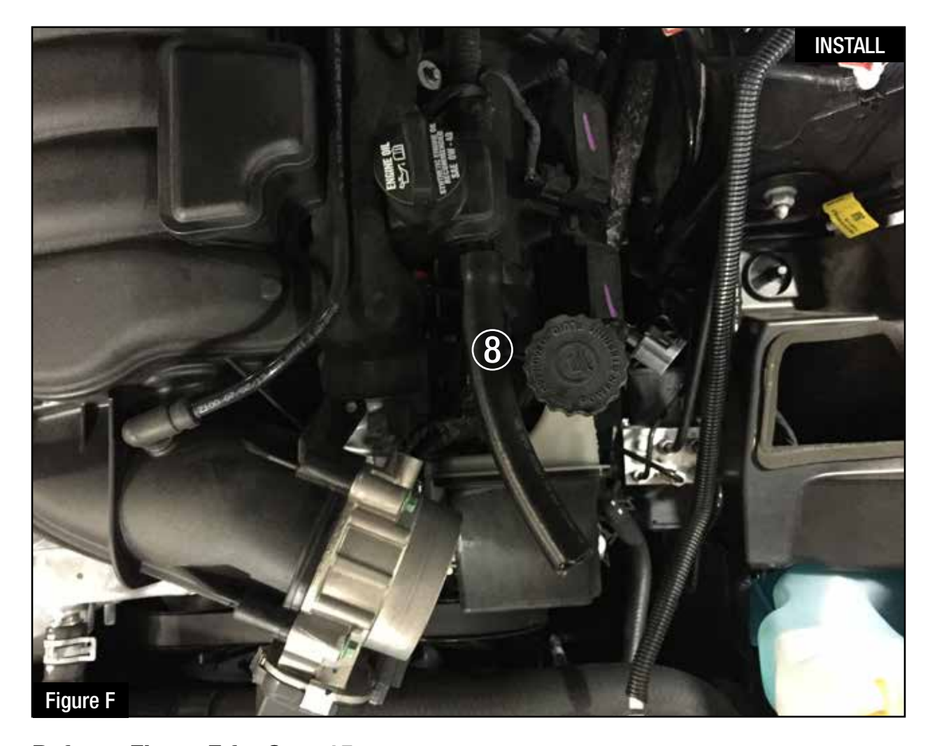
Refer to Figure F for Step 15

Step 15: Using the provided rubber hose, connect one end to the engine crank case fitting (8) as shown.