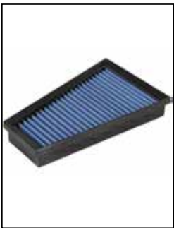
OE Replacement Air Filter