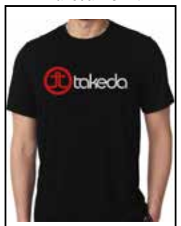
P/N: 40-30332 (M) 40-30333 (L) 40-30334 (XL)

To purchase any of the items above, view airflow charts, dyno graphs, photos, and video; please go to aFepower.com.