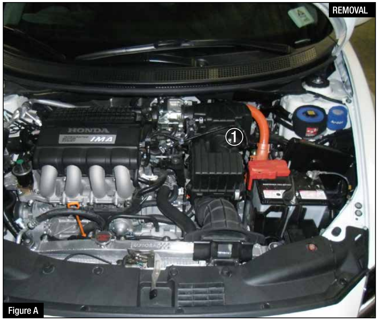
Refer to Figure A for step 1

Step 1: Disconnect MAF sensor (1) and harness clip that holds it to the top air box.