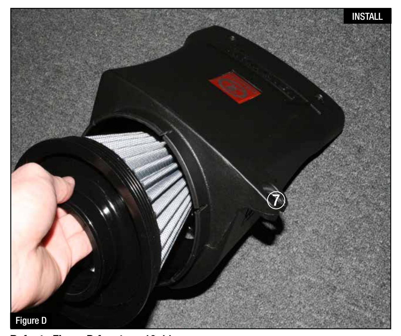
Refer to Figure D for steps 10-11