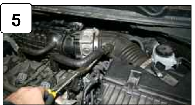
Remove crank case line from intake tube using pliers.