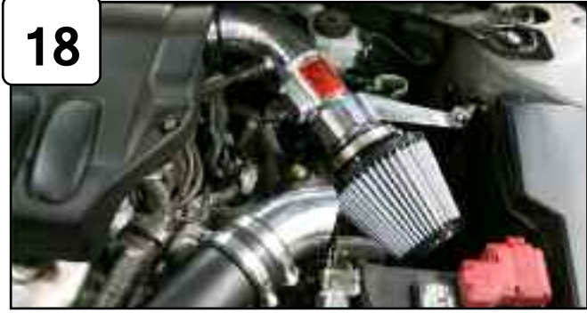
The installation of your Takeda performance intake is now complete. Please check all components and retighten if necessary. Thank you for choosing Takeda!