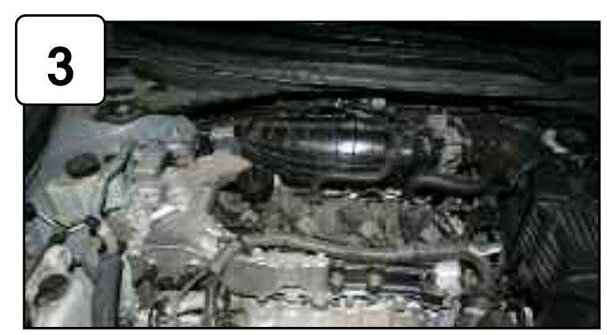
Remove engine cover.