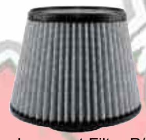
Replacement Filter P/N: TF-9004D