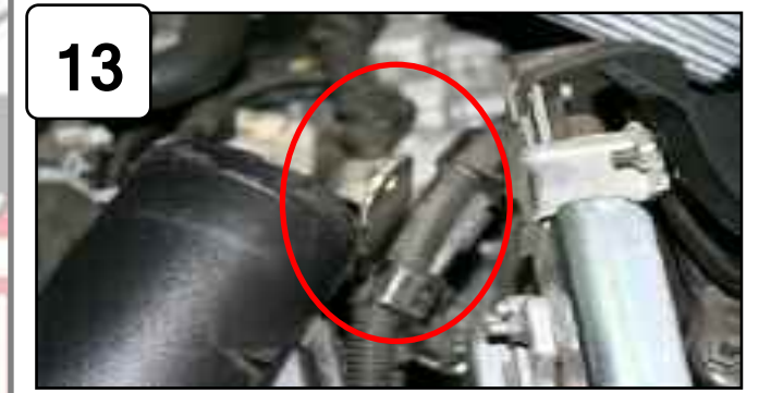
Now Install bracket and secure with screw from step 12 and tighten.

For replacement part(s) or "Restore Kit" please log on to takedausa.com P.O. Box 1719 Corona CA, 92878