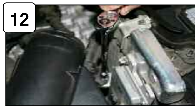
Loosen screw holding ECU wire harness. See step 13.