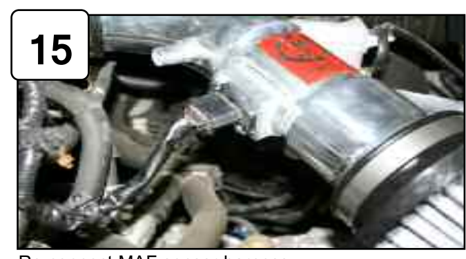
Re-connect MAF sensor harness.