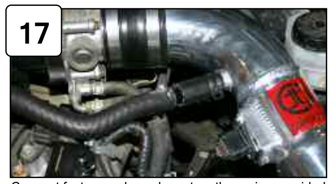
Connect factory and new hose together using provided 5/8" barb fitting. Re-connect battery terminals. Reinstall engine cover.