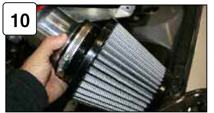
Attach air filter to intake tube and tighten clamp using 5/16" nut driver.