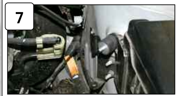
Install M6 male/female isolation mount to ECU harness bracket and secure.