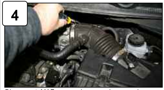
Disconnect MAF sensor harness. Loosen clamp on throttle body.