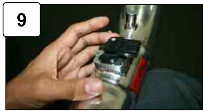
Remove MAF sensor from stock intake. Install into new intake tube and secure using provided M4 screws.