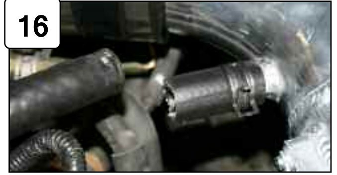
Install 5/8" hose provided to intake tube with factory clamp.