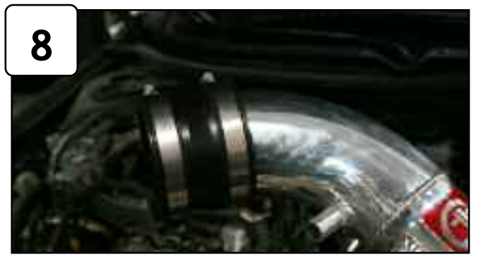
Attach coupler with clamps to tube. Do not tighten.