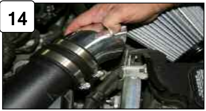
Install cold air duct using coupler with clamps provided. Using screw, nut and washer provided, tighten tab on duct to bracket using 10mm socket or wrench. Tighten clamps using 5/16" nut driver.