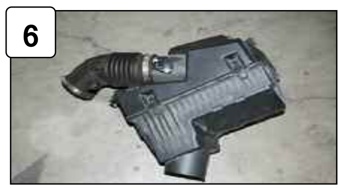
Remove stock intake out of vehicle.