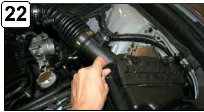
Remove complete intake out of vehicle.