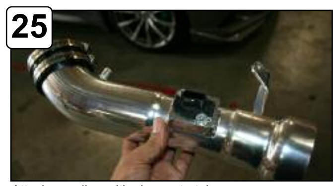
Attach coupling with clamps to tube.