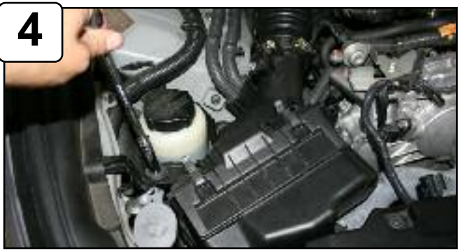
Disconnect MAF sensor harness. With 10mm socket or wrench loosen bolt holding in air box.