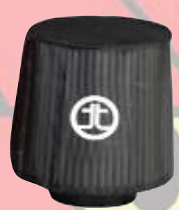
Pre Filter P/N: TP-7011B

Note: Filter Cleaning: When cleaning your Pro Dry S ™ filter, be sure to use only "Restore Kit" (Takeda P/N: TP-7015C Pro Dry S ™ cleaner only.)