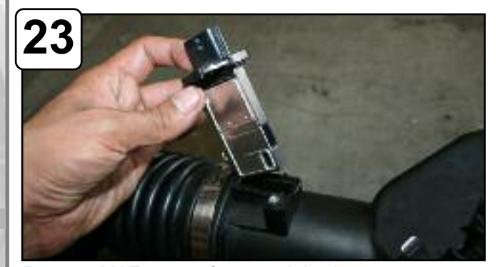
Remove MAF sensor from stock intake.