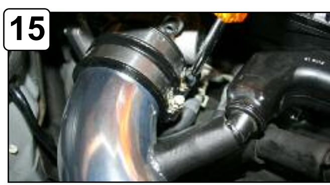
Tighten all clamps using 5/16" nut driver. Attach the crank case line using the provided 5/8" hose.