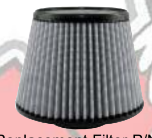
Replacement Filter P/N: TF-9009D