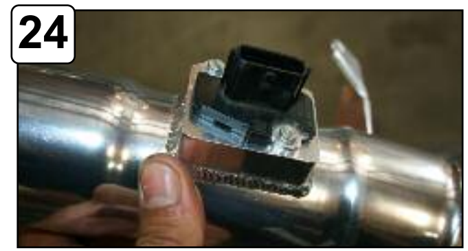
Install MAF sensor to new tube using provided M4 screws.