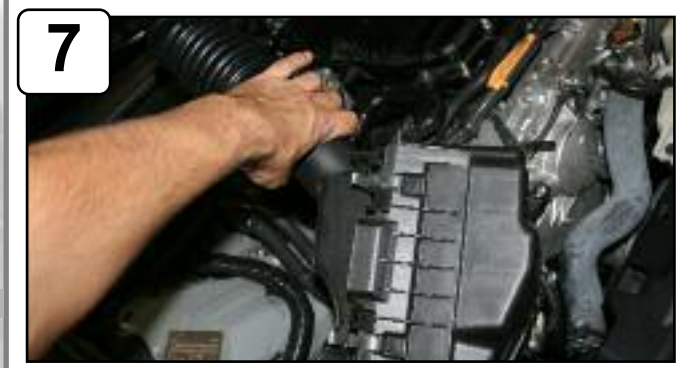
Remove complete intake out of vehicle.