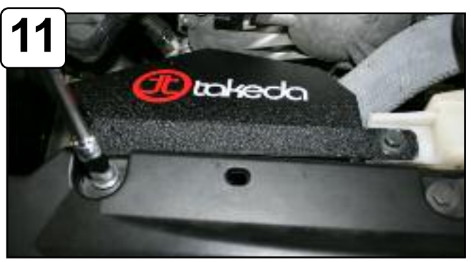
Install heat shield and secure to radiator support and tighten using bolts from previous step.