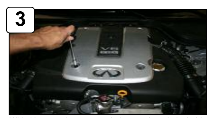
With 10mm socket or wrench, loosen the 5 bolts holding in engine cover and remove.