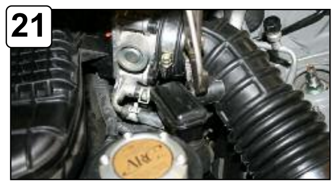
Disconnect the crank case line using pliers.