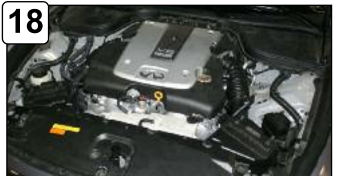
Complete Stock driver side intake.