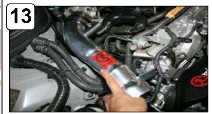
First re-connect MAF sensor harness. Install into vehicle and position tube. Do not tighten clamps.

For replacement part(s) or "Restore Kit" please log on to takedausa.com P.O. Box 1719 Corona CA, 92878