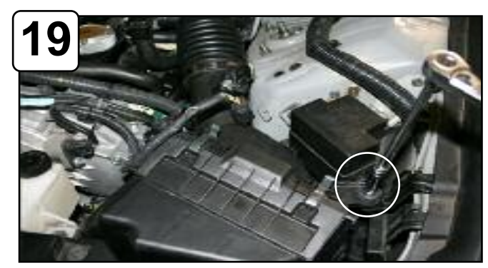
With 10mm socket or wrench, loosen the bolt holding in air box.