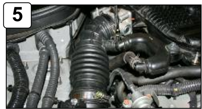
Loosen clamps on intake using 5/16" nut driver.