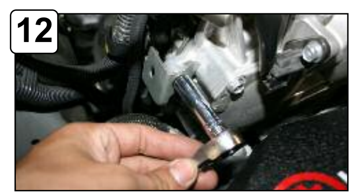
Loosen bolt on engine securing harness bracket.