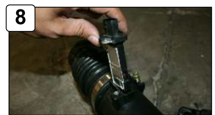
Remove MAF sensor from stock intake.