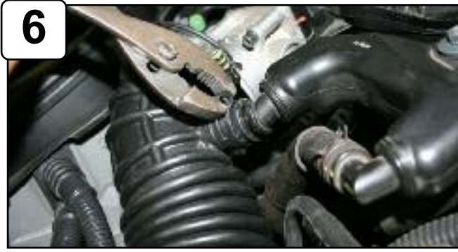
Disconnect the crank case line from the intake tube using pliers.