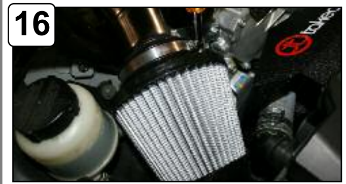
Install air filter and tighten using 5/16" nut driver.