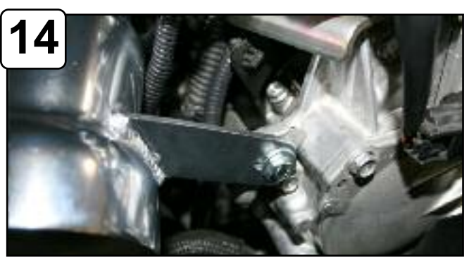
Secure tab to engine and tighten using provided screw and flat washer.