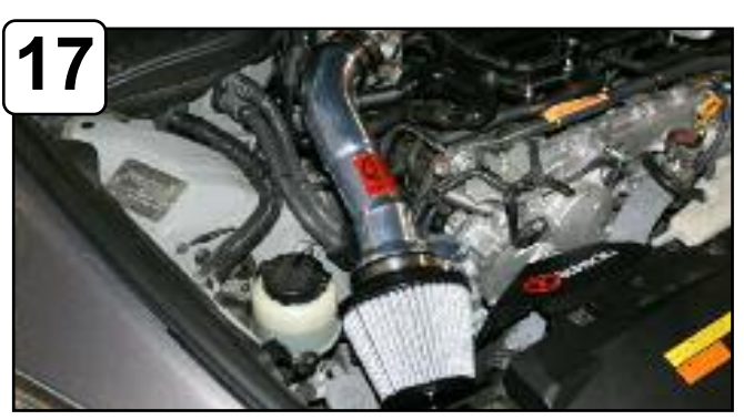
Your passenger side is now complete. Continue to page 3 for driver side installation..

Place the included CARB EO sticker on or near the device on a smooth, clean surface. E.O. identification label is required in passing the smog check inspection.