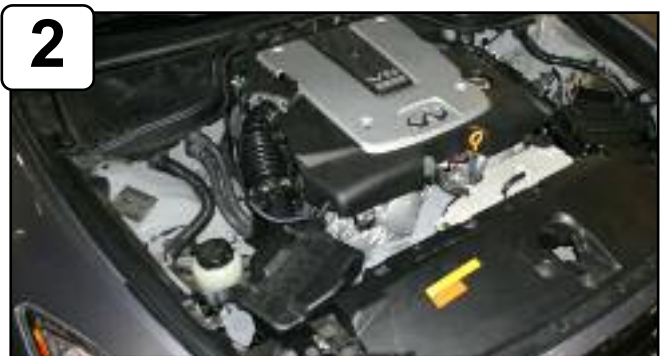
Complete Stock passenger side intake. Please disconnect battery terminals before installation.