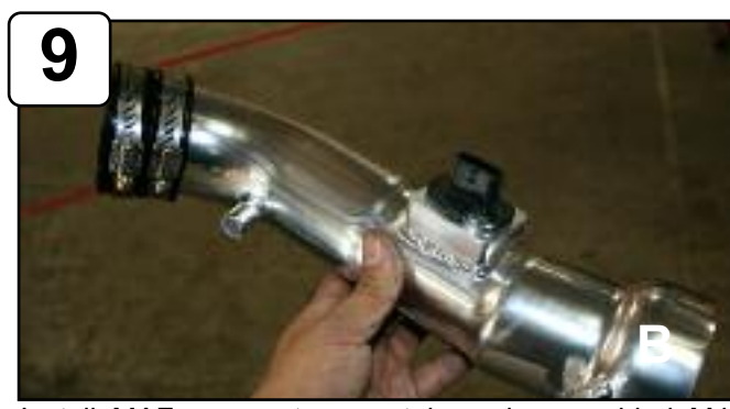
Install MAF sensor to new tube using provided M4 screws. Attach coupling with clamps to tube.

Note: Please read instructions before installation and have tools ready.