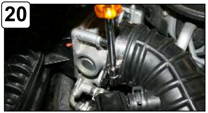
Disconnect MAF sensor harness. Loosen clamps using 5/16" nut driver.