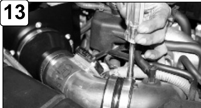
13 Tighten all clamps using 5/16" nut driver.