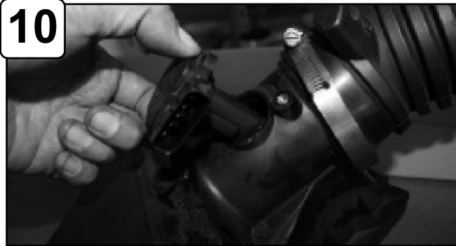
10 Remove MAF sensor from stock intake.

For replacement part(s) or "Restore Kit" please log on to takedausa.com P.O. Box 1719 Corona CA, 92878