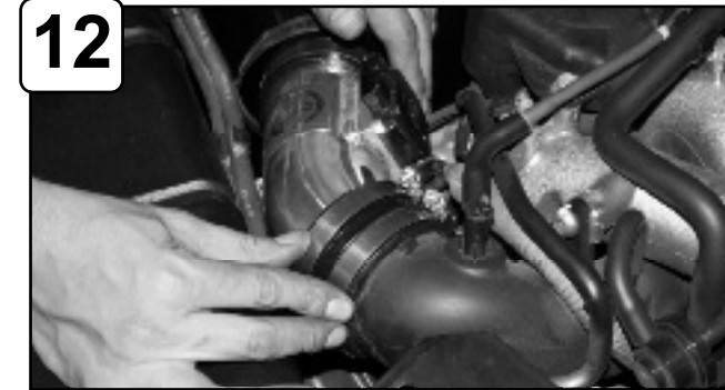
12 Install and position new tube to throttle body and filter adaptor.