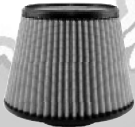
Replacement Filter P/N: TF-9007D