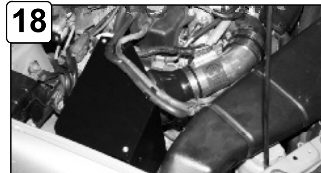
18 The installation of your Takeda performance intake is now complete. Please check all components and re-tighten if necessary. Thank you for choosing Takeda! Place the included CARB EO sticker on or near the intake system on a smooth, clean surface. E.O. identification label is required in passing the smog check inspection.