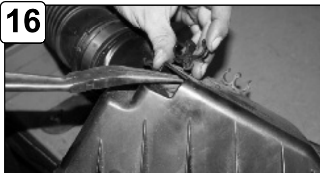
16 Remove clips from upper half of air box. Attach onto new cover.