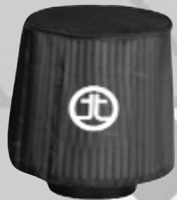
Pre Filter P/N: TP-7011B

Note: Filter Cleaning: When cleaning your Pro Dry S™ filter, be sure to use only "Restore Kit" (Takeda P/N: TP-7015C Pro Dry S™ cleaner only.)