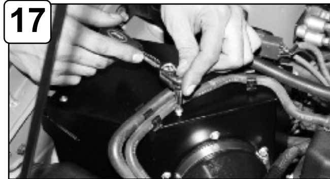
17 Install cover and tighten using 4mm allen key. Attach vacuum lines to cover tabs.