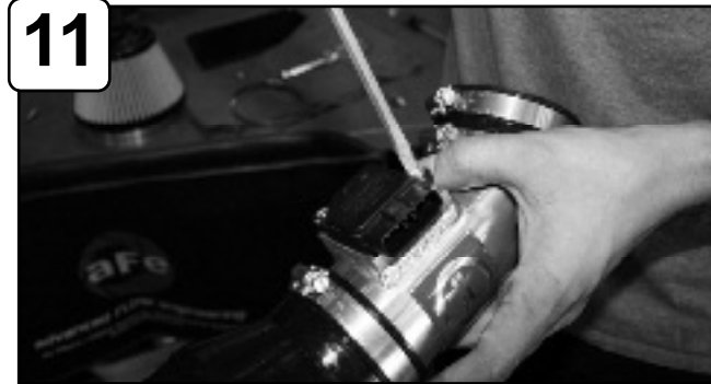
11 Install MAF sensor on intake tube using M4 screws provided. Attach couplers with clamps to intake tube.