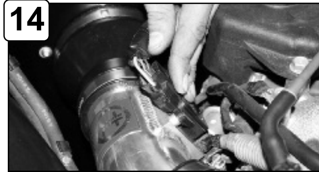
14 Re-connect MAF sensor harness.