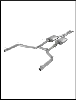
Cat-Back Exhaust System