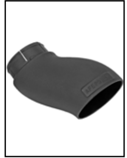
Dynamic Air Scoop