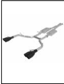
Cat-Back Exhaust System

P/N: 49-32067-P (Pol. Tips) 49-32067-B (Blk. Tips) (Challenger Only!)