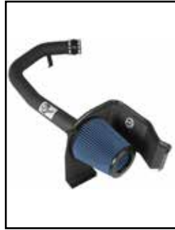
Cold Air Intake System