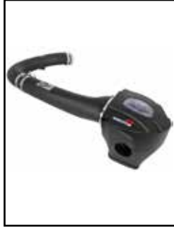
Momentum GT Intake