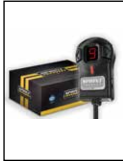
Sprint Booster V3

P/N: 77-12002 (Challenger) 77-12009 (Charger)