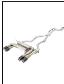
Downpipe Back Exhaust

P/N: 49-36323-1C (C/F Tips) 49-36323-1P (Pol. Tips)