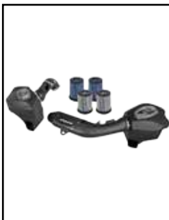
Cold Air Intake System