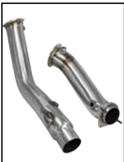
Twisted Steel Downpipes

P/N: 48-36313 (Race) 48-36312-1 (Street)