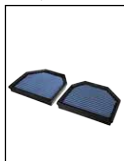
OE Replacement Filters