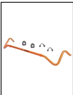
Front Sway Bar