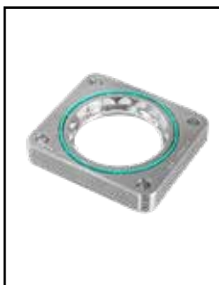
Throttle Body Spacer