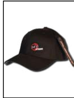
aFe Power Hat