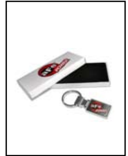
aFe Key Chain